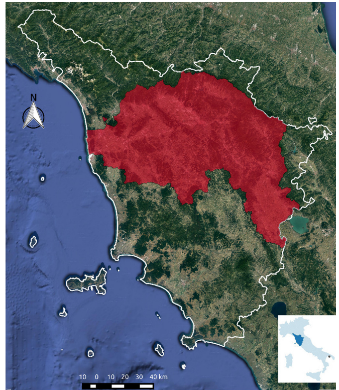
Fig. 1. Study area: the Arno basin in Tuscany (in red) and the Tuscany region in Italy (blue).

To date, various human dimension studies have explored the role of recreational anglers in biological invasions, as human behaviour is a major source of uncertainty in fisheries and in the management of IAS (Fulton et al. , 2011; Hunt et al. , 2013). However, most of these works focused on at risk-behaviours which can lead to accidental introduction of aquatic IAS, like improper bait disposal or equipment cleaning (Gates et al. , 2009; Seekamp et al. , 2016), or on the potential effect of information provisioning and normative change as tools to prevent them (Azevedo-Santos et al. , 2015; Howell et al. , 2015; Pradhananga et al. , 2015; Fujitani et al. , 2016). On the other hand, fewer studies addressed drivers of deliberate fish introductions (Drake et al. , 2015), especially for Mediterranean Europe (Banha et al. , 2017a). This research gap must be addressed, as deliberate angling is responsible for the arrival of many invasive alien fish species in Mediterranean freshwater (Gherardi et al. , 2008), including some major ecosystem engineers, like Silurus glanis (Carol et al. , 2009; Copp et al. , 2009), Cyprinus carpio (Vilizzi, 2012; Vilizzi et al. , 2015), Micropterus salmoides (Garcia-Berthou et al. , 2000) and Zander lucioperca (Lorenzoni et al. , 2006; Kopp et al. , 2009),