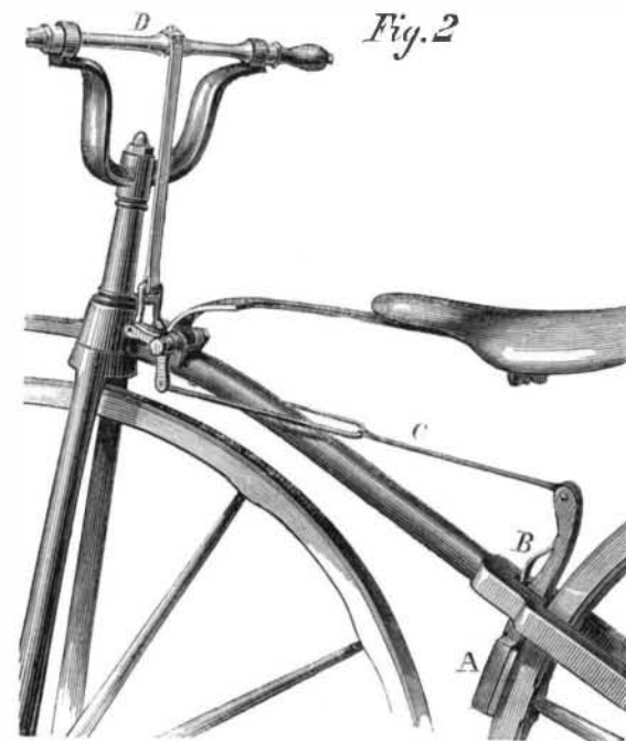
MONOD'S IMPROVED BRAKE BICYCLE.

ventor or manufacturer was, therefore, the establishment of a New York agency by constituting some dealer in articles similar to that he manufactured a partner, in a certain sense, or a sharer in the profits. But the inconvenience and annoyance was felt more by the purchaser. If a stranger in the city, his labors and time in traveling from one point to another were very considerable; but if he did not expend both, he had little opportunity to compare articles intended for the same purpose, but built by different makers on different plans. Or if he did procure opportunities to see different machines, by visiting as many places as there were machines, he could not compare the two except as he remembered the points of those he had already examined; there was no opportunity to examine them