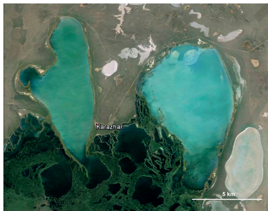
Figure 1. Aerial view of the study site with Karazhar field station. Korgalzhyn State Nature Reserve, Aqmola district, Kazakhstan. Light blue colour indicates open fresh water and dark green shallow lakes and pools surrounded by reed beds. Salt lakes appear white and steppe vegetation is brown.

The 'waterfall spectacle' was observed on 13-vi-2015 around sunset between 21:00 and 21:30 h QYZT (UTC + 6 h). That evening, the air was absolutely still and the sky was clear. Approximately 30 to 40 minutes before sunset, the dragonflies, previously distributed across large areas, started to congregate in swarms above potential night roosts such as tall shrubs, buildings, and reed vegetation, as they had done previously on calm evenings (Fig. 2).