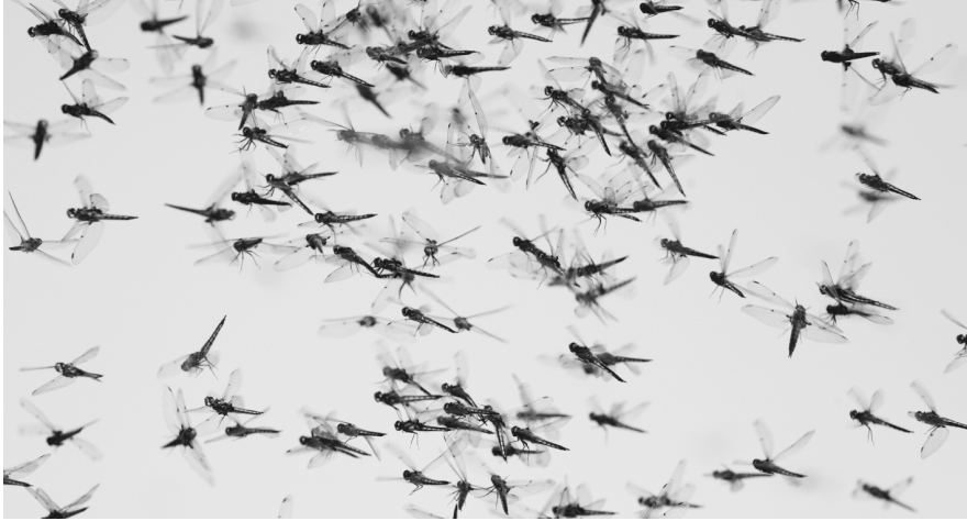
Figure 2. Detail view of a swarm of Libellula quadrimaculata . Korgalzhyn State Nature Reserve, Aqmola district, Kazakhstan (13-vi-2015).