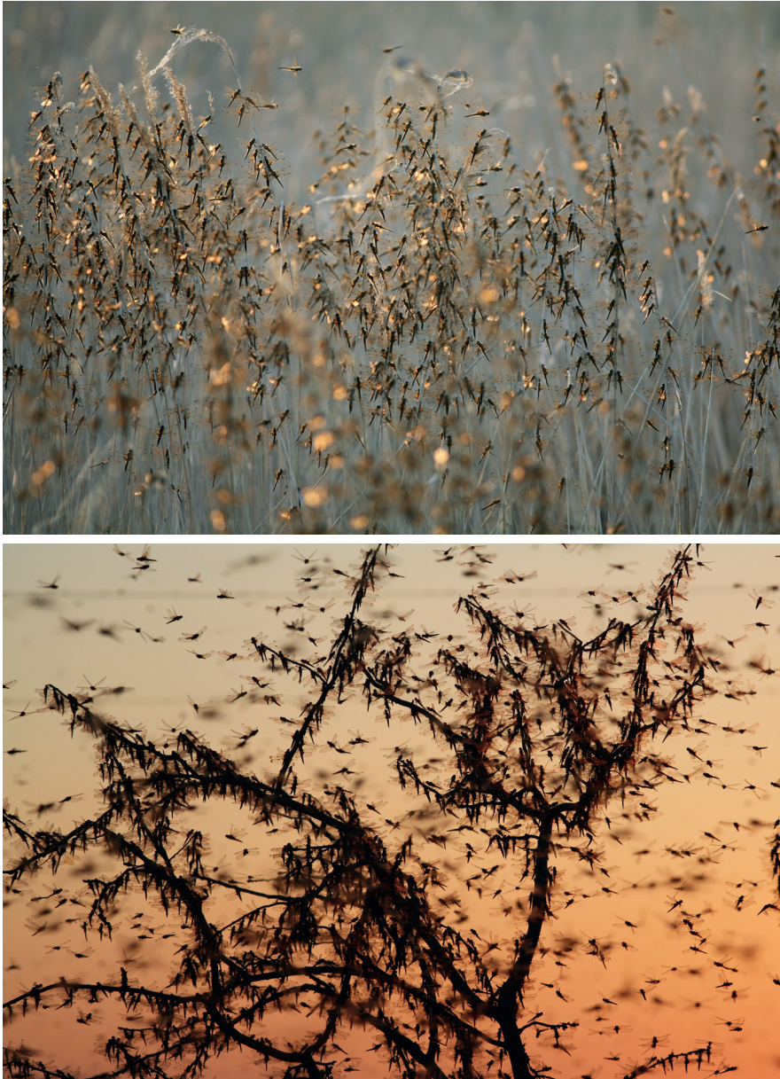
Figure 4. Aggregations of Libellula quadrimaculata at communal roosting sites. Korgalzhyn State Nature Reserve, Aqmola district, Kazakhstan (13-vi-2015).