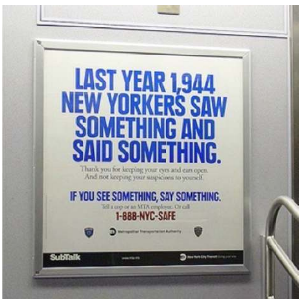
Figure 4: New Yorkers taking the train are invited to be vigilant about their surrounding

bipartisan support during the 112th US Congress, protects from libel action those who accuse their peers of terrorism.<sup>218</sup>