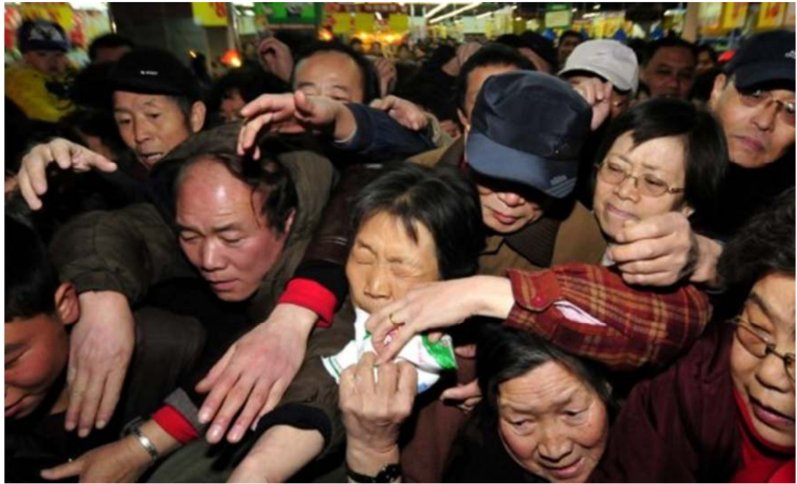
Figure 3: After the Fukushima meltdown, shoppers in China rushed to snap up salt. 168

"would prefer to keep the commodity at home rather than in the hands of society and it reflects a lack of confidence in the supply system of authorities". 167