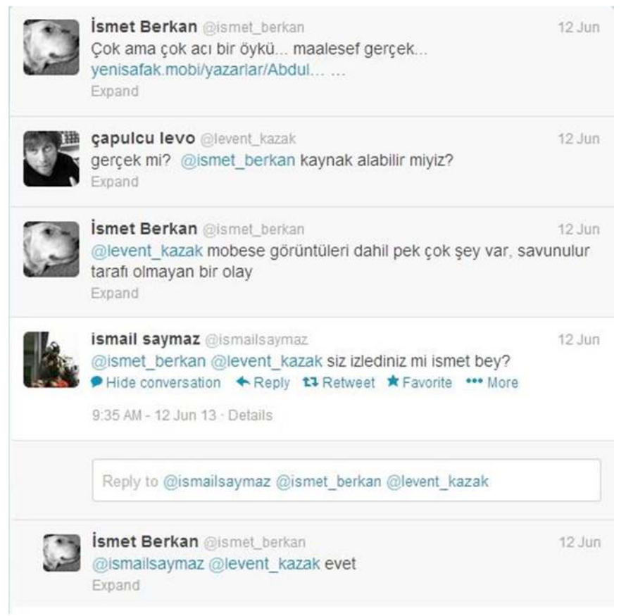
Figure 2: Tweets by journalist Ismet Berkan regarding the CCTV footage of the alleged attack on Woman Wearing a Hijabi

Currently, the official investigation on the alleged attack is going on. CCTV video footage released on 13 February 2014 and broadcasted by the popular national TV channel, Kanal D , suggests that actually none of the surveillance cameras had recorded any evidence of such assault. <sup>129</sup> Indeed, the only recording available showed the crowd passing by the woman in question with no sign of physical attacks (although, possibility of verbal abuse cannot be discounted through the CCTV cameras).