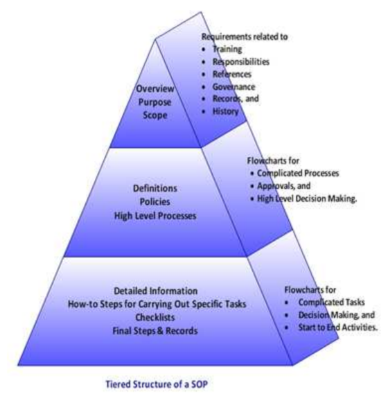
Figure 2. General structure of a Standard Operating Procedure<sup>51</sup>

A typical general structure of such a procedure and its constituent parts is shown below.