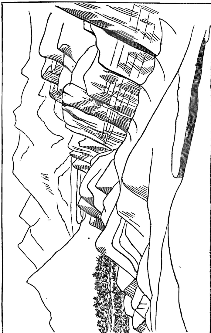
Bluffs of ice. End of Glacier, looking toward the southeast.

right. No. 2 shows the appearance of the glacier in the opposite direction. A broad fissure between one level of the ice and the next is filled with snow.