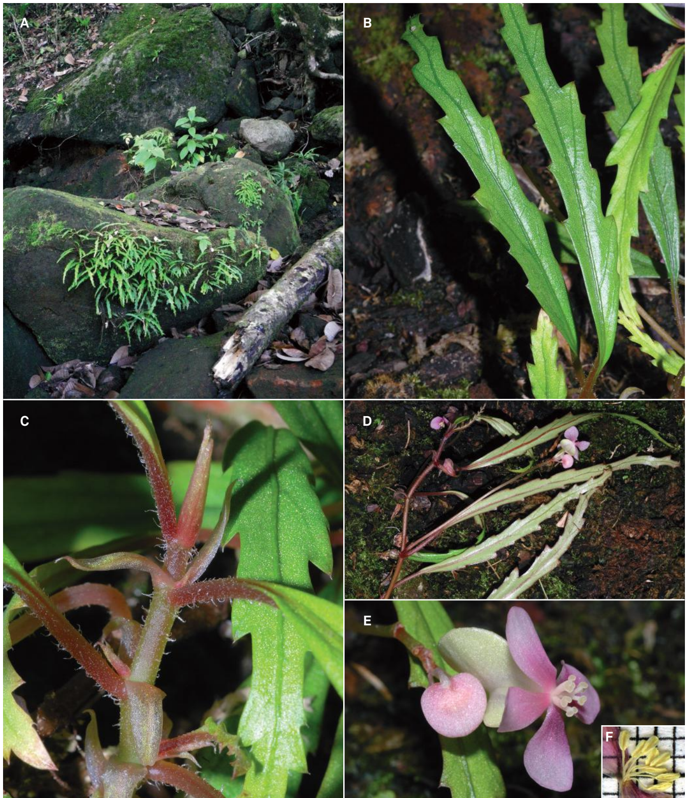
Fig. 2. – Begonia henrilaportei Scherber. & J. Duruisseau. A. Habit in the type locality; B. Leaf adaxial surface; C. Apex of stem; D. Leaf abaxial surface; E. Inflorescence showing female flower and male flower bud; F. Stamens.