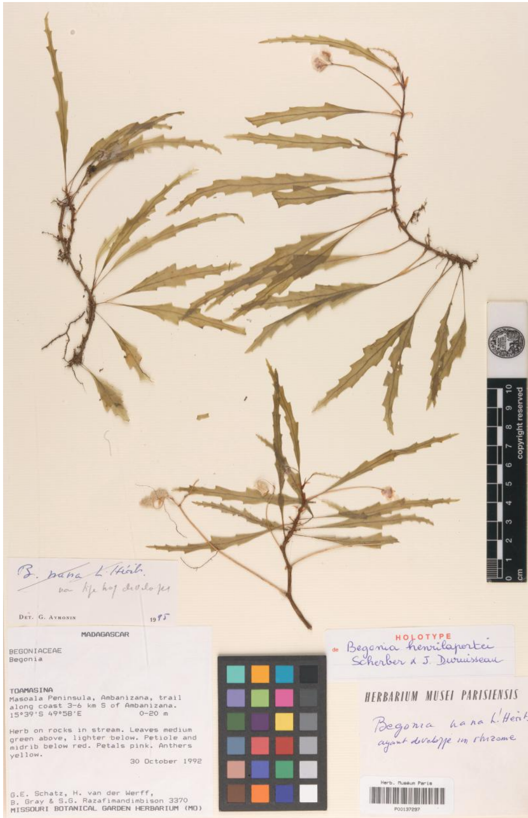
Fig. 3. – Holotype of Begonia henilaportei Scherber. & J. Duruisseau. [Schatz et al. 3370, P]