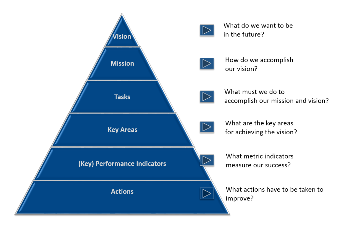
Figure 1.1: Relation between vision, mission, performance indicators, and actions.