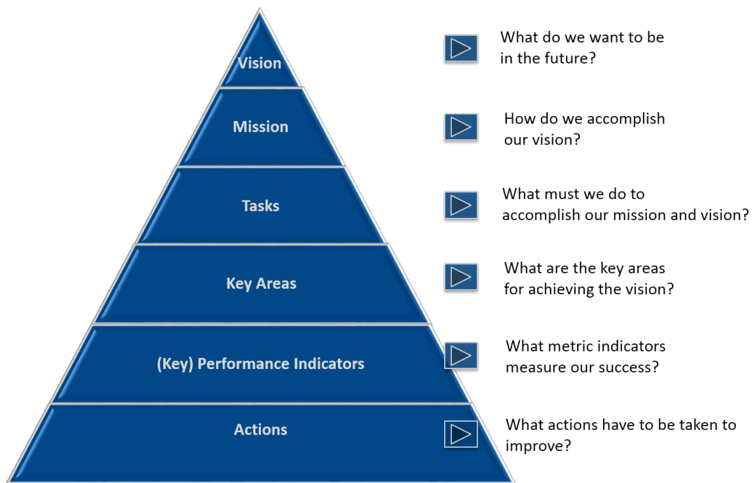
Figure 1.1: Relation between vision, mission, performance indicators, and actions.