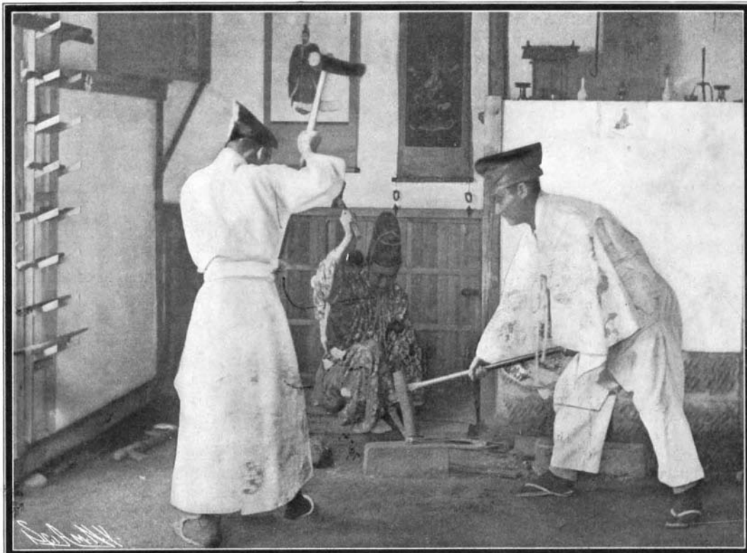
Forging One of the Ingots From Which the Sword is Made.