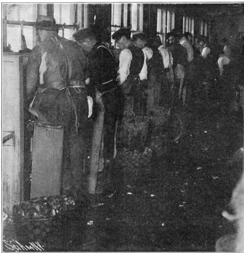
Opening the Oysters for Market.