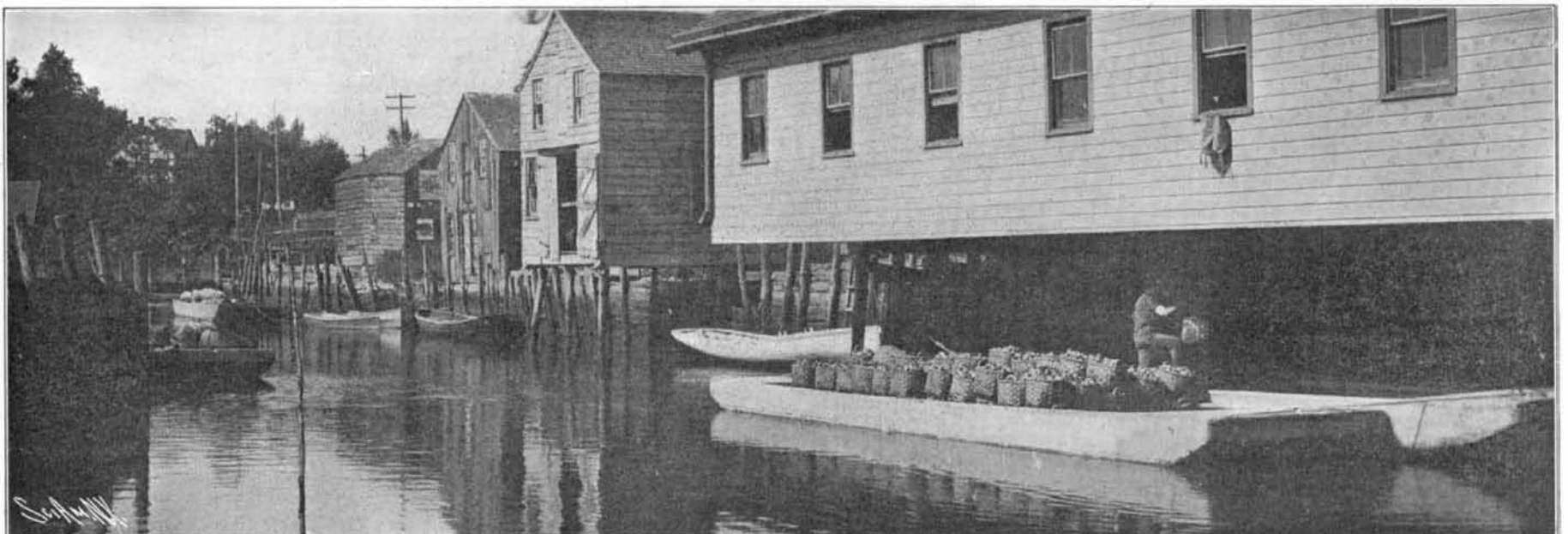
After the Oysters Have Lain in Fresh Water for Six Hours, They are Removed to the Oyster House.

tongs or dredges. The tongs have long wooden handles terminating in groups of iron fingers in which the oysters are caught. TONGING is slow and extremely laborious work and is fast being supplemented by the dredge. This instrument is formed of a large and heavy iron rake, to which is attached a bag, partly