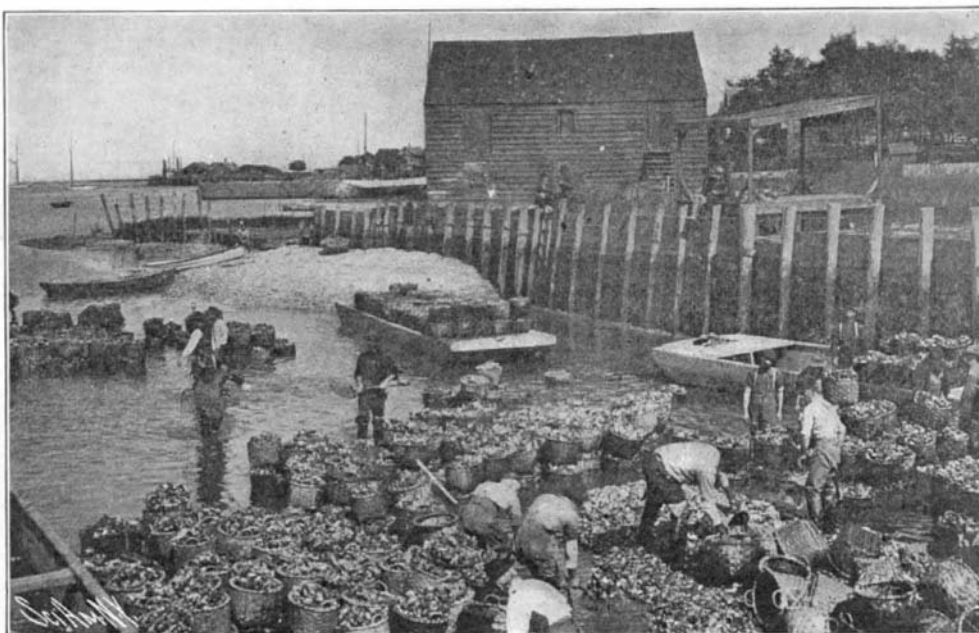
After Having Been in Fresh Water, the Oysters are Transferred to Baskets and Carried to the Oyster House.

complete they must be taken up for market. In some cases the beds run dry at low tide and then the oysters are raked into heaps and taken off the beds. In most instances, however, the beds are always under water and the oysters are then taken up either by hand-