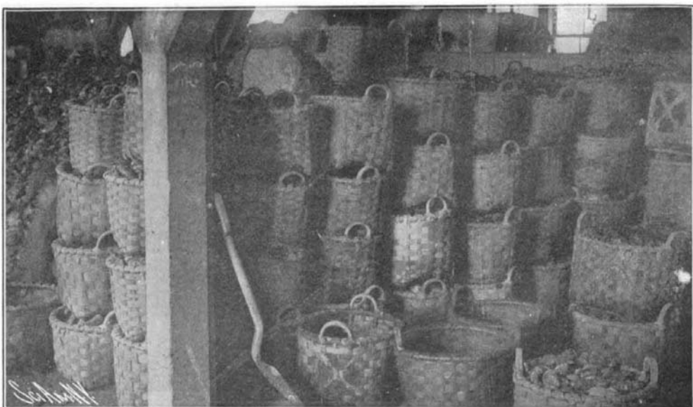
Culled Oysters Ready for Market.