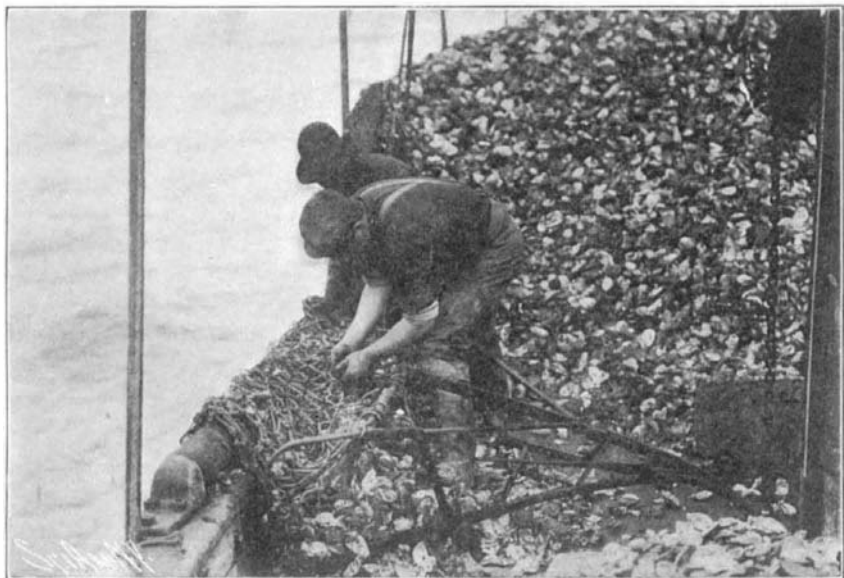
Deck of a Dredge Boat, Showing Crew Repairing a Break in the Dredge.

fresh water, the maximum heat will mostly be stored at the contact points of the two layers. If the fresh-water layer be evaporated without being heated, the temperature will be compensated for. Since oil and water do not diffuse into one another, as is the case of fresh and salt water, the maximum temperature in