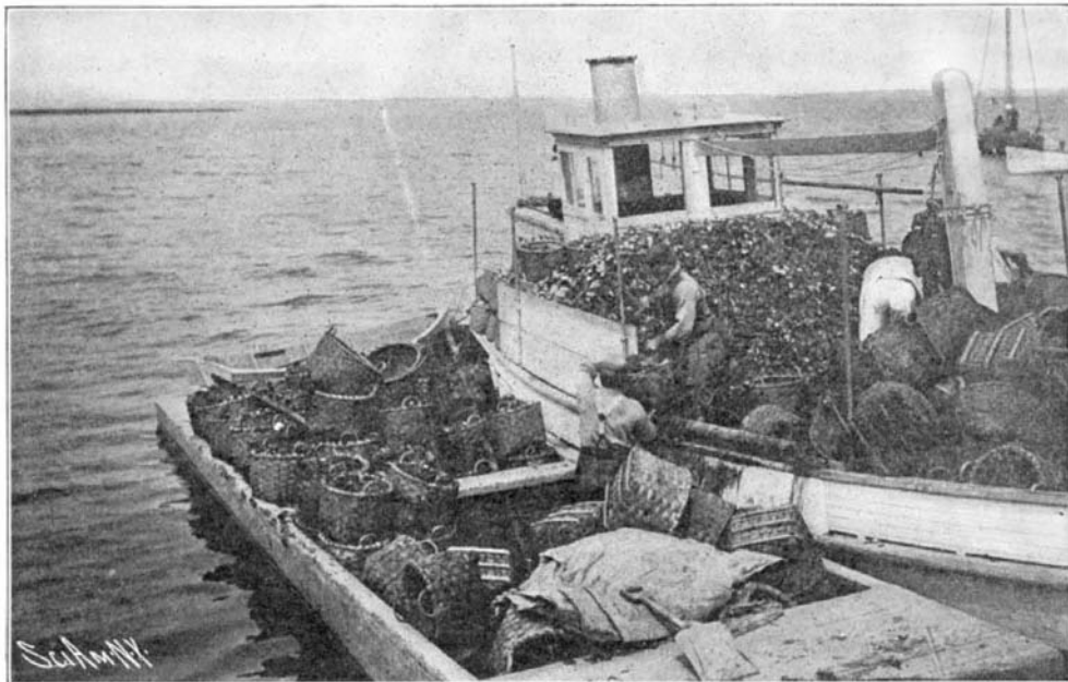
Unloading the Oysters from a Dredge Boat into a Scow for Transportation to Fresh Water.

market or opening houses in various ways, depending upon the locality and traffic conditions. Most of the oysters reach New York market in bulk by boats, as will be appreciated when one inspects the large fleet of oyster boats always to be seen at Gansevoort and Fulton markets, New York city, during the oyster