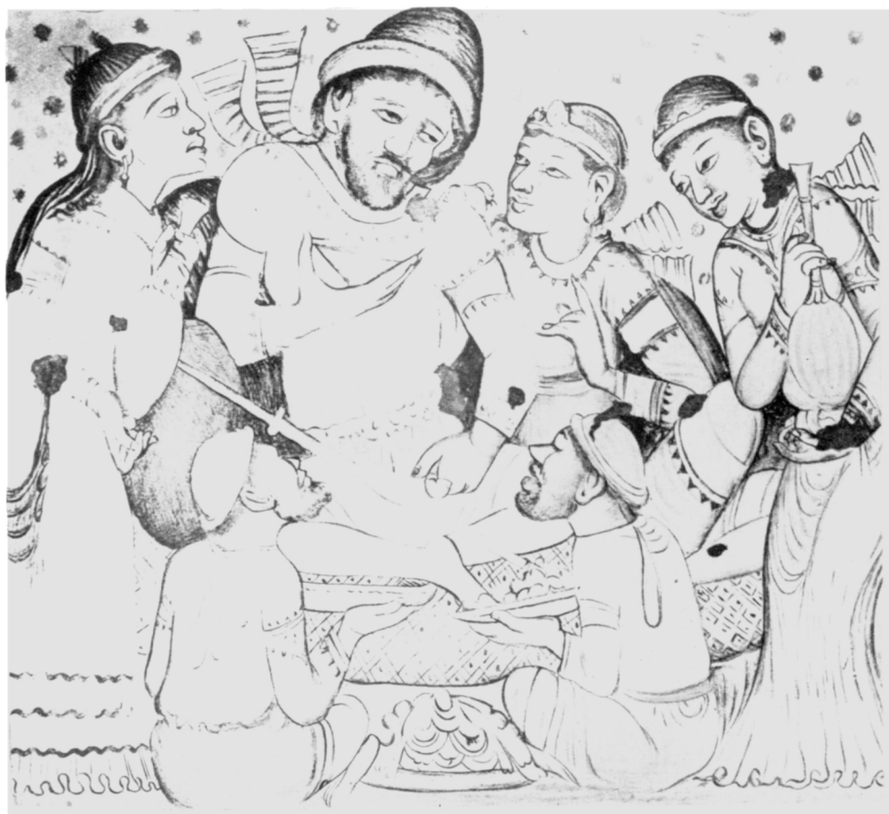
Fig. 2. Persian noble (Khusrū Parvīz) and lady: Ajanta Cave I (after Griffiths)

Published by the Society of Antiquaries of London, 1912