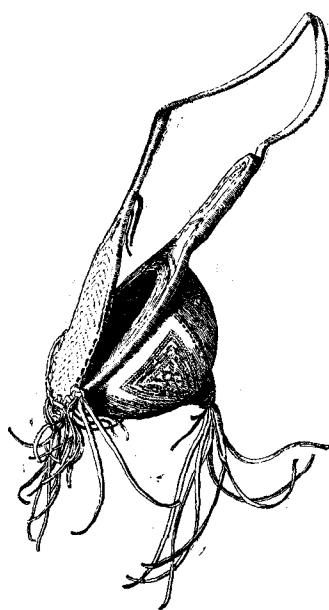
Fig. 2. Case for drinking bowl; from Fergana.

It seems likely, both from the amount of wear that the surface of the bowl shows, as well as from its simple form, that it was intended to be taken from place to place for the king's use, doubtless on such occasions as the hunting expedition it illustrates. A drinking vessel for use in the palace would be more convenient when provided with a foot. As an illustration of the means by which it was no doubt carried about, I give here a figure (fig. 2) of the case of a similar