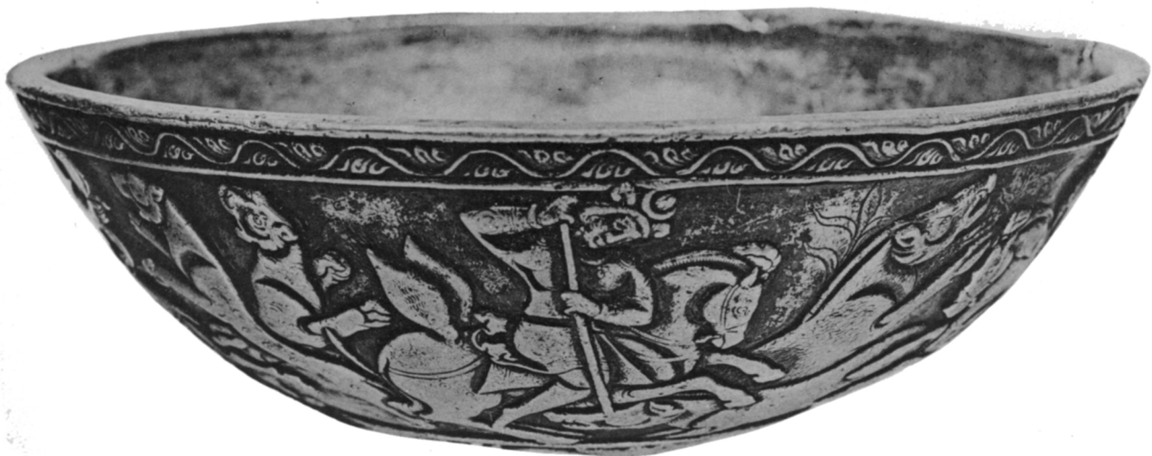
A SILVER SASSANIAN BOWL †

Published by the Society of Antiquaries of London, 1912