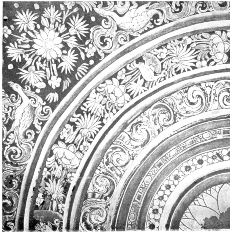
Fig. 1. Ajanta cave fresco—to show the birds ending in foliage (after Griffiths)