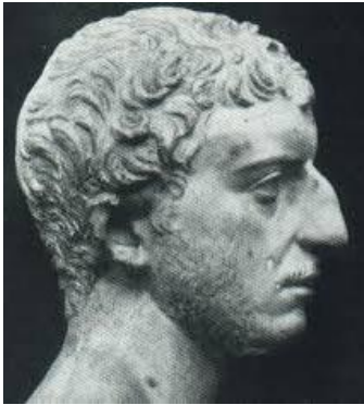
Figure 6. Josephus Flavius (?) (Ny Carlsberg Glyptotek, Copenhagen, Denmark).