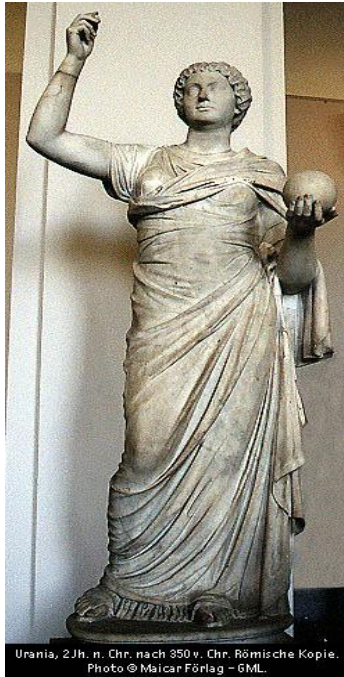
Figure 4. Urania, Muse of Astronomy. The Muse holds a ball in her left hand and a pointer in her right hand. Second century Roman copy of a statue of Urania; probably created c. 350 BC (Pergamon Museum, Berlin).

Though Rabbi Yona's mention of Urania looks more like a side remark, unrelated to the original story, one may imagine the statue being present in the Citadel c. 200 BC. This would suggest a Greek-Egyptian sky observatory on the Citadel's roof, built by an order of one of the first four Ptolemys. We know that astronomy definitely flourished in 3 rd century BC Alexandria, and its renowned astronomer, Timocharis, conducted many observations of the stars as early as 300 BC (Toomer 1998: 330-8). A Greek-Egyptian garrison might have carried out not only military but also cultural functions among barbaric people.