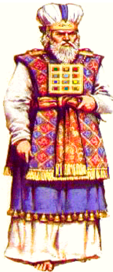
Figure 1. High Priest's garments

Accepting Josephus' testimony would mean the stones were certainly in use during most of the 2 nd century BC, and in all likelihood, the high priest would have put this breastplate on before going to meet the king. And indeed, both Josephus ( Antiq. 11:331) and the Talmud (see below) emphasized that the high priest wore the full set of his regalia at the encounter (Fig. 1). Thus the king recognized this image , being familiar with a description of it at some time in his past (Belenkiy 2005).