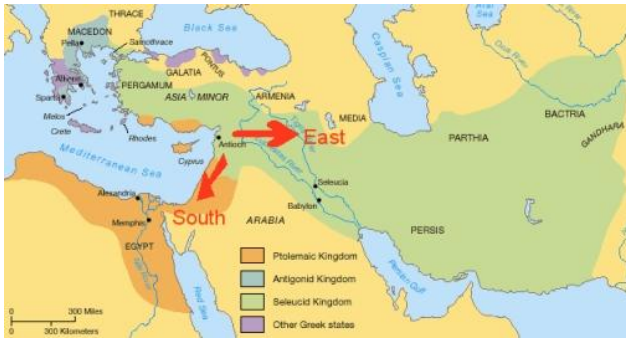
Figure 2. The Greek states in the 3rd century BC

The Chremonidean War, waged by the Greek states against Macedonian King Antigonos Gonatas, is usually dated to 267-261 BC, so the Egyptian-Spartan alliance was likely concluded before the War, in 268 BC. This leaves a full 15 years (from the beginning of Ptolemy's II's reign) for the Septuagint to have been composed. To date the composition to 273-269 BC seems quite realistic (see, e.g., Gmirkin 2006: 142).