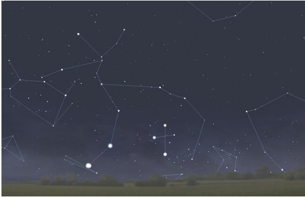
Figure 5. Constellations Centaurus and Crux at night of January 9, 198 BC, seen from Jerusalem at 10 m altitude (Program STELLARIUM).

Even if the Egyptian garrison in the Citadel resisted Antiochus for a period up to three months, Antiochus could have seen Canopus, and if six months, the brightest stars of Crux and Centaurus.