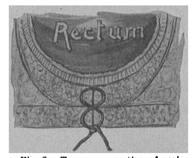
Fig. 2.—Transverse section of perineum showing how the inner (upper) loop of the figure-eight suture unites the ani muscles, and the outer (lower) loop unites the transverse perineus muscles and skin. The knot is on the skin surface.

suture material for use in cases of peri..eal repair is of some moment, and second in importance only to the method of introducing the sutures. I have long since discarded absorbable material such as catgut and kangaroo-tendon on account of the uncertainty of absorption, varying tensile strength and low power of resistance to infection. Of the nonabsorbable materials the so-called silkworm-gut, because of its uniform strength and pliability, makes the ideal