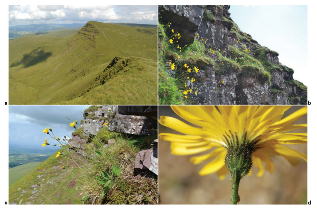
Figure 3 Pictures of Hieracium attenboroughianum . (a) Locality on NW side of Cribyn. (b) Habitat on Old Red Sandstone mountain rocks. (c) Plant. (d) Capitulum.

Hieracium vagicola P.D. Sell which is endemic to the English side of the Wye Valley, differs in having dense stellate hairs on the involucral bracts and more deeply toothed leaves (sparse stellate hairs on the involucral bracts and remotely denticulate teeth in H. attenboroughianum ).