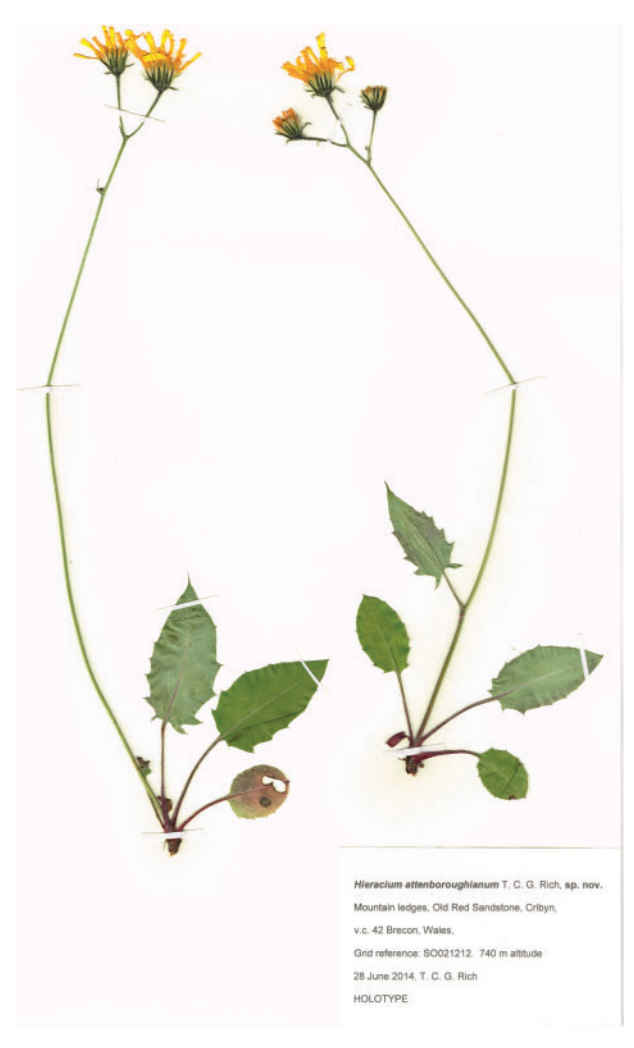
Figure 2 Holotype of Hieracium attenboroughianum.

and many glandular hairs on the involucral bracts in H. attenboroughianum ).