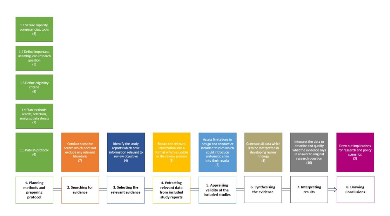
Figure 2. Example of flowchart summarisation of a SR, from Whaley et al. (in preparation) "Conduct of Systematic Reviews in Toxicology and Environmental Health Research (COSTER): A Code of Practice"