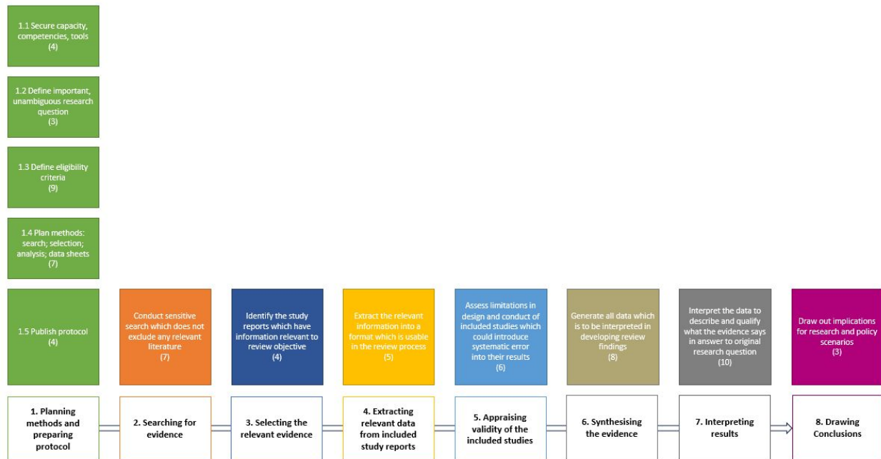
Figure 2. Example of flowchart summarisation of a SR, from Whaley et al. (in preparation) “Conduct of Systematic Reviews in Toxicology and Environmental Health Research (COSTER): A Code of Practice”