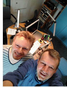
Abb. 3: Transfer of knowledge via radio interview, Heliopolis project