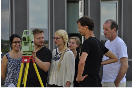
Abb. 1: Orientation in calibration, Heliopolis project