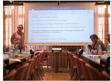
Abb. 1: Members of mainzed, mainzed-Community Day in September 2017