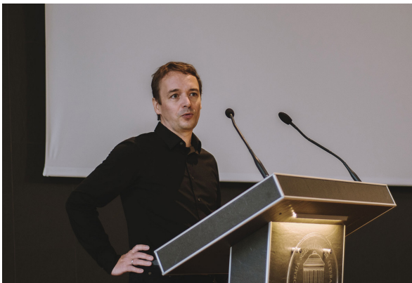
Abb. 3: Inputsession, mainzed-Community Day in December 2017