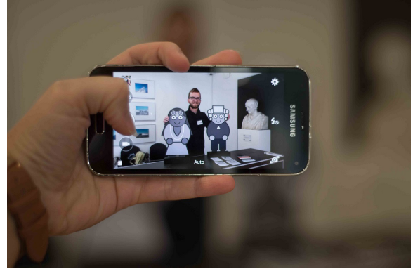
Abb. 1: Picture session with the stand-up displays at the Get Together Digital Humanities Rhine-Main, September 2017