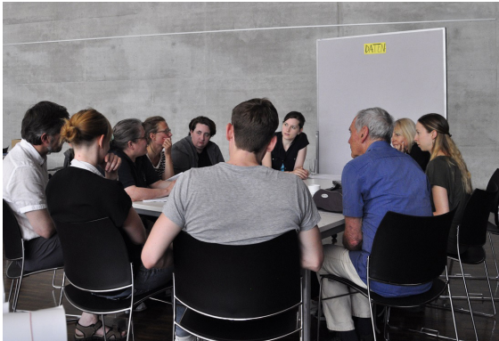
Abb. 1: Discussion group on the question of technical standards, Onboarding June 2018

In autumn 2018, the cultural data hackathon Coding Da Vinci is going to take place in Mainz for the first time. Mainzed is involved in the preparations of this event where the mainzed network partners - the Academy of Sciences and Literature | Mainz and the Mainz University Library - will take part. Among other things, mainzed organised the information event Onboarding on 18 June 2018.