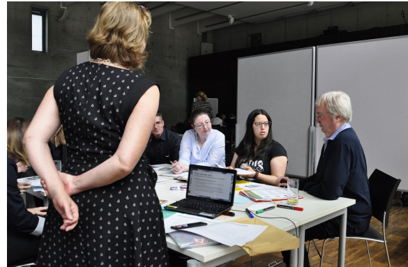
Abb. 2: Discussion group on the question of an appropriate licence, Onboarding June 2018