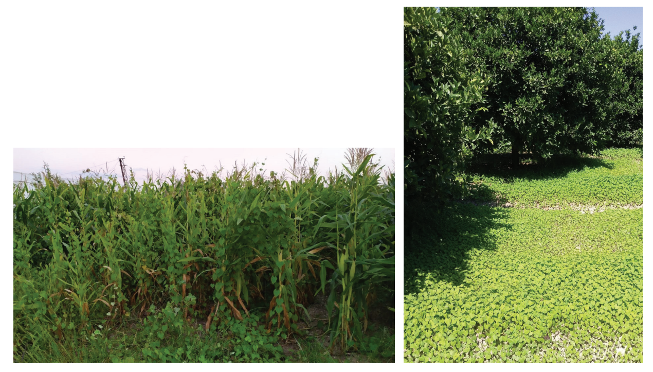
Figure 2. Ipomoea triloba L. in maize and citrus cultivation in Turkiye.

and our survey revealed its new distribution in cotton production areas in Ardebil province. Ipomoea indica threatens native plants such as Gleditsia caspica and native grasses in the Mazandaran province (Amini et al. 2020). The field observations showed that the presence of I. leucantha and I. lacunosa reduced the growth of native plants such as Urtica dioica , Mercurialis sp., Ficus carica and Punica granatum (Table 2, Fig. 3). We observed I. leucantha as a new serious weed in cotton producing areas in the Kordkuy township (Fig. 4). Ipomoea hederacea is a troublesome weed in summer crops in Golestan (Pahlevani and Sajedi 2011; Siahmarguee et al. 2022).