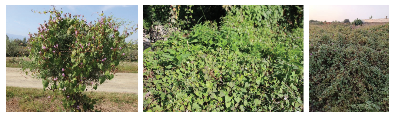
Figure 3. Ipomoea leucantha Jacq., I. lacunosa L. and I. indica (Burm.) Merr. in different locations from left to right, respectively, in Golestan (1 and 2), and Mazandaran (3) Iran.