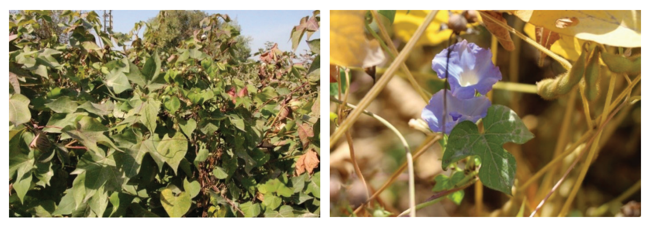
Figure 4. The growth of Ipomoea leucantha Jacq.and I. hederacea Anon. on cotton and soybean plant to reach light and shading out crop in the north of Iran.

disease hosting have also been reported for this species (Yang et al. 2017; Shen et al. 2019; Ouattara et al. 2023; Rifkin et al. 2023). In general, the competitive potential of alien Ipomoea species has been attributed to their fast growth and regeneration capacity (Sparkes and Panetta 1997; Norsworthy and Oliver 2002; Pagnoncelli et al. 2017; Averill et al. 2022; Randall 2012). Ipomoea triloba is a troublesome weed in many crops in the Philippines, Sri Lanka, Bangladesh, India, and Indonesia (Moody 1989; Holm et al. 1997). Reported crop losses due to different Ipomoea species vary from 25–90%, depending on their population density (Howe and Oliver 1987; Defelice 2001; Rizzardi et al. 2004; Price and Wilcut 2007; Bhattacharjee et al. 2009; Averilla et al. 2022; Pazzini et al. 2022). The Ipomoea species are ranked among the most troublesome weeds in cotton and soybean in the USA and Japan (Webster and MacDonald 2001; Norsworthy and Oliver 2002; Yasuda and Sumiyoshi 2010).