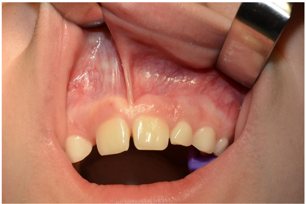
Fig.1. Condition before the surgery; slight diastema visible.