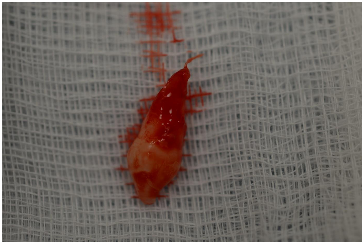
Fig.4. Removed mesiodens.