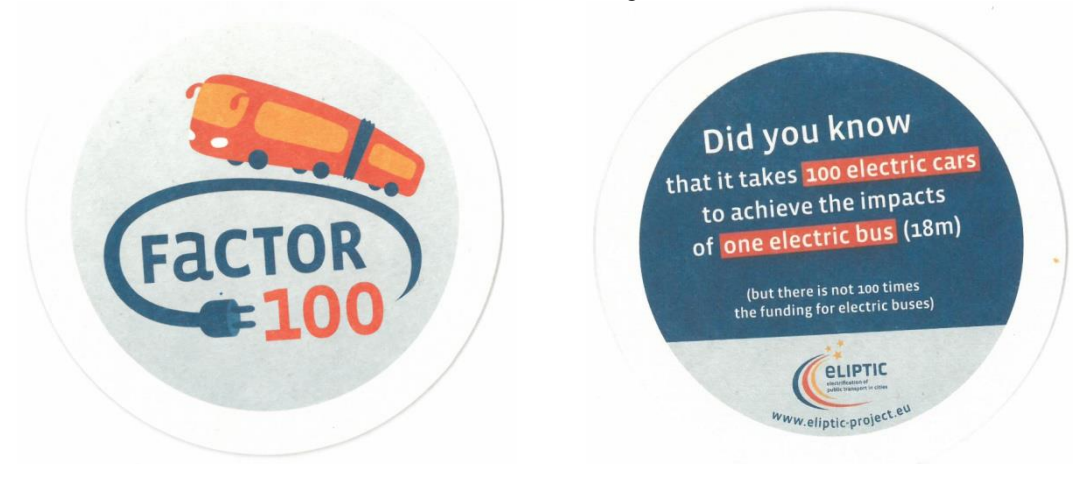
Fig. 2 (a) "factor 100" coaster frontside; (b) "factor 100" coaster backside

Together with standard leaflets and roll-up banners, ELIPTIC also produced something unconventional for a transport research project: "factor 100" coasters. The intention was to reduce the core message to few enough words to fit on a coaster. The message: "Did you know that it takes 100 electric cars to achieve the impacts of one electric bus (18m) (but there is not 100 times the funding for electric buses)".