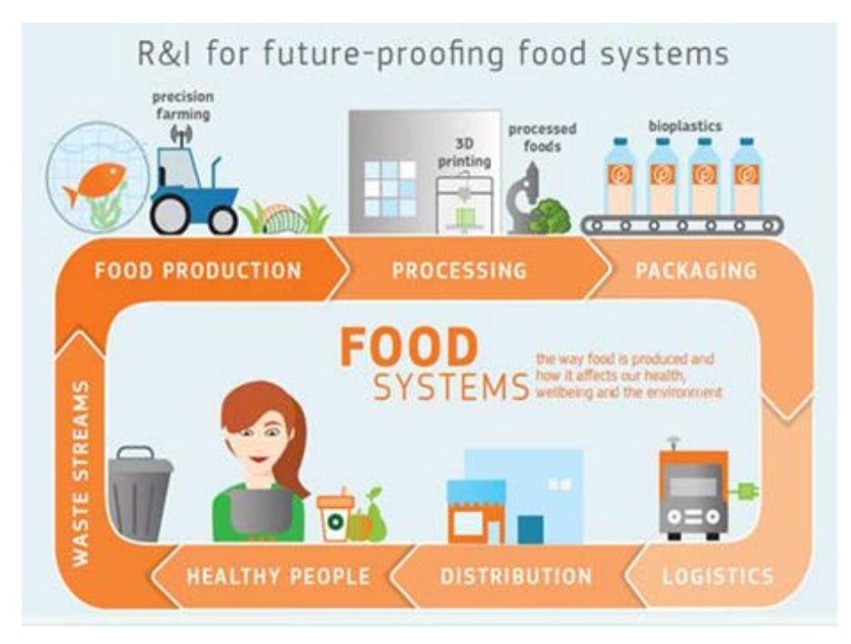
Figure 2 The Food System approach as presented by DG RTD as part of the FOOD 2030 strategy

The set up of the break outs was such that they cover different parts of the Food System approach as conceptualized by DG-RTD in its FOOD2030 strategy (Figure 2 below), one topic covering the consumer, health, nutrition, logistics and packaging aspects called Food Safety, Nutrition & Health, and a second topic covering the production, processing and waste streams aspects titled 'Smart farming, food security & the environment'. Finally in a third session the enabling conditions for system wide innovation at a higher and lower aggregation level were considered with the title: `Gene-based approaches from omics to landscape.'