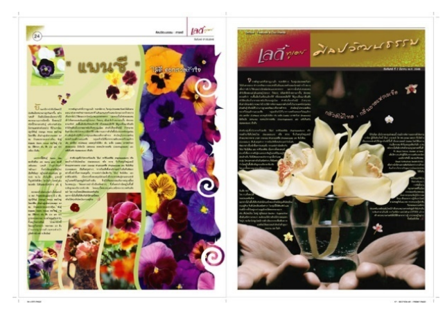
Fig. 8 Newspaper design with a Natural Personality

In addition, the crucial factors of desirable elements of a women's newspaper are: