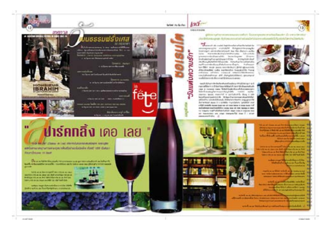
Fig. 7 Newspaper design with a Chic Personality