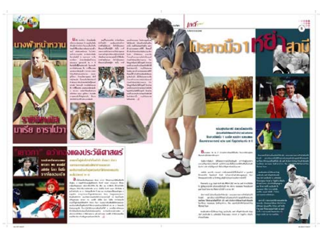
Fig. 5 Newspaper design with a Modern Personality