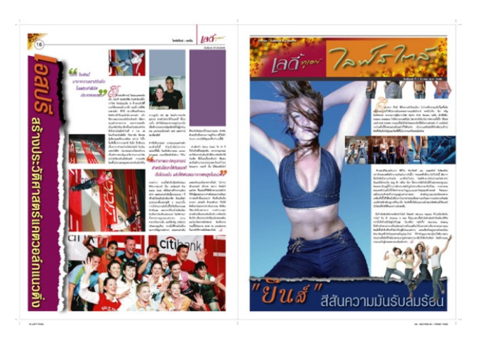
Fig. 6 Newspaper design with a Chic Personality