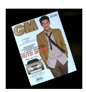
Fig. 1 The differences between magazines for women and men