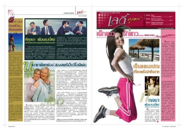
Fig. 4 Newspaper design with a Modern Personality