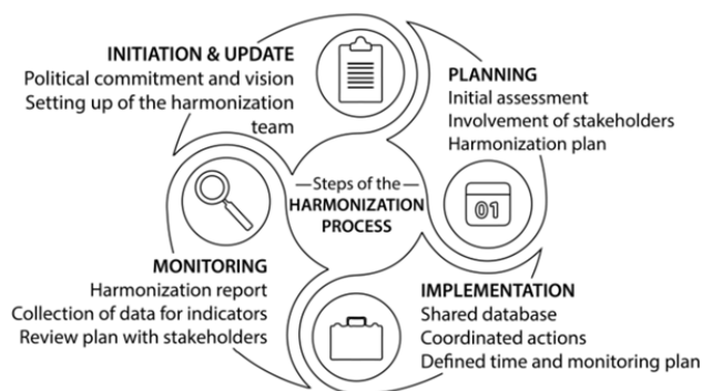
Fig. 2 Steps of the Harmonization Process. Diagram adapted from the original one in the Guidelines

The second chapter corresponds to the harmonization process itself and includes the necessary information to follow the four steps in order to achieve the harmonization of energy and mobility plans. Fig. 2 presents the four steps, initiating with the confirmation of political commitment and the setting up of the harmonization team, continuing with the planning stages, the implementation and finalizing with the monitoring and controlling of the harmonization process. This chapter concludes with some recommendations for an intermediate stage of updating and continuation of the harmonized plans, setting up the basis for a new cycle.