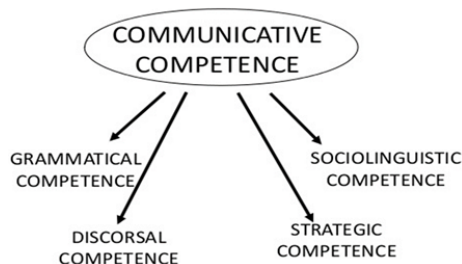
Fig. 1 CC components