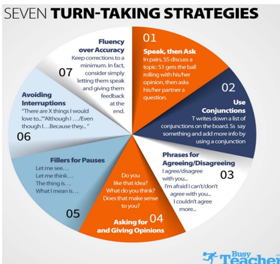
Fig. 4 Seven Turn-taking strategies for EFL speaking modules [65]

research, all suggest the explicit teaching of pragmatics, SAT, CP, and Turn-taking rules. In [64], a very thorough description of how turn taking techniques are employed. Moreover, [65] suggested seven steps/ strategies as to what to use and how in a speaking module (see Fig. 4). An online interactive website for the teaching of speaking [66].