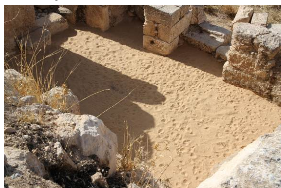
Fig 16 Mosaic reburial