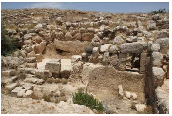
Figure 2 General View of the Byzantine Bath

The Byzantine Bath was discovered during the excavation work carried out in 1998 in the south-eastern area of the site (Fig. 2) (Suleiman, 1999).