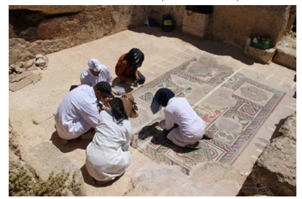
Figure 12 Documentation of the mosaic

The aim of mosaic consolidation is to improve the mechanical endurance of the degraded materials as well as to increase its chemical resistance (Mora, 1986).