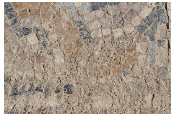
Figure 11 Incrustations