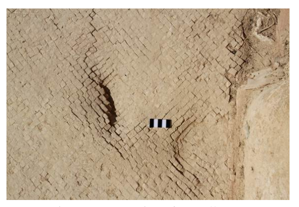
Figure 8 Depression of Tessellatum

The mosaic had also some fragmented and deteriorated tesserae, especially the black ones, because the structure of the black tesserae is weak and subject to mechanical alteration. Moreover, some deposits were found on the surface of the tesserae in the form of dirt, soil, and other hard deposits (Fig.11).