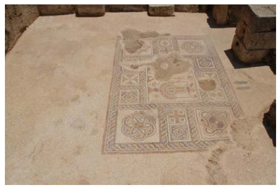
Figure 3 General View of the Mosaic Floor

Unfortunately not enough information was available about the bath and the mosaic; there is no records of the excavation of 1998. The only documentation available some photographs done about this mosaic.