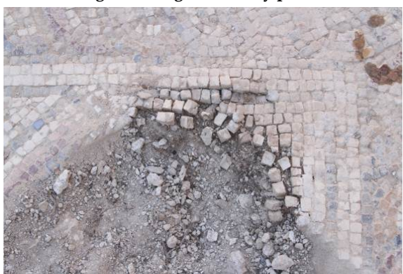
Figure 10 Disintegrated tesserae