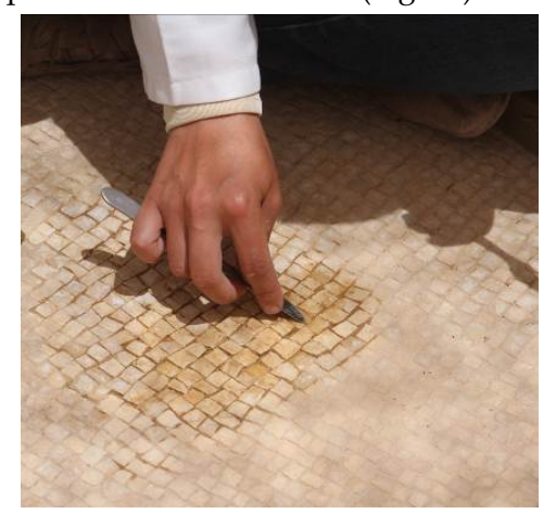
Figure 14 Manual mechanical cleaning

In addition, Cellulose fiber (Paper pulp) saturated with AB57 solution was applied for four hours. Before proceeding with the application, the tessellatum was wetted in order to reduce the penetration of the chemical, and then the poultice was laid in the mosaic surface, covered with plastic film to prevent drying out. Immediately after the removal of the poultices, the surface was washed with water and plastic brushes. Furthermore, scalpels and small chisels were used to remove the solidified deposits such as hard crust (Fig. 14).