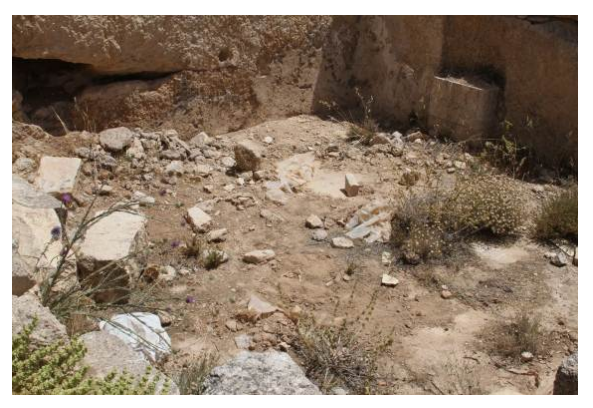
Figure 4 The mosaic before backfill removed

The sand layer was removed manually and by brushing. The action has to be carried out with special attention to avoid disturbing the plastic layers, and then the plastic layers were removed only after they had been allowed to dry out gradually to prevent salt crystallization on the mosaic surface. Under the plastic sheets, plants and small roots were also existed (Fig. 4). There were removed by using hand tools during the removal of the plastic sheets.