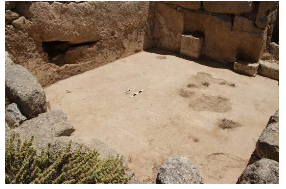
Figure 5 The mosaic after backfill removed