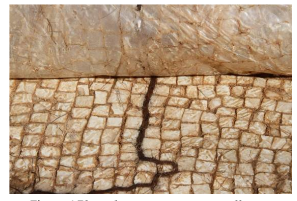
Figure 6 Plants have grown over tessellatum