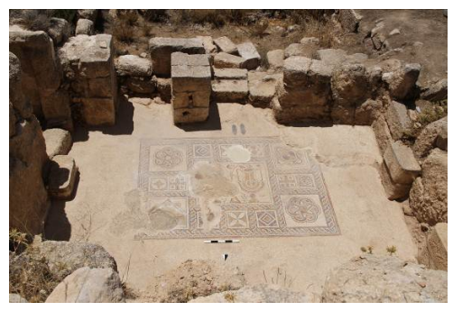
Fig 15 The mosaic after conservation