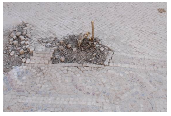
Figure 9 Bulge caused by plants