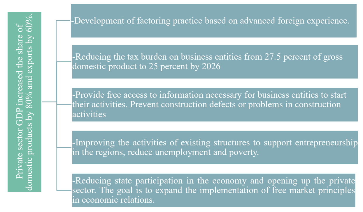
Table -1: Increasing the share of the private sector in GDP to 80 % and its share in exports to 60 %

It is planned to create conditions for organizing entrepreneurial activity and forming permanent sources of income, increase the share of the private sector in GDP to 80 percent and its share in exports to 60 percent.