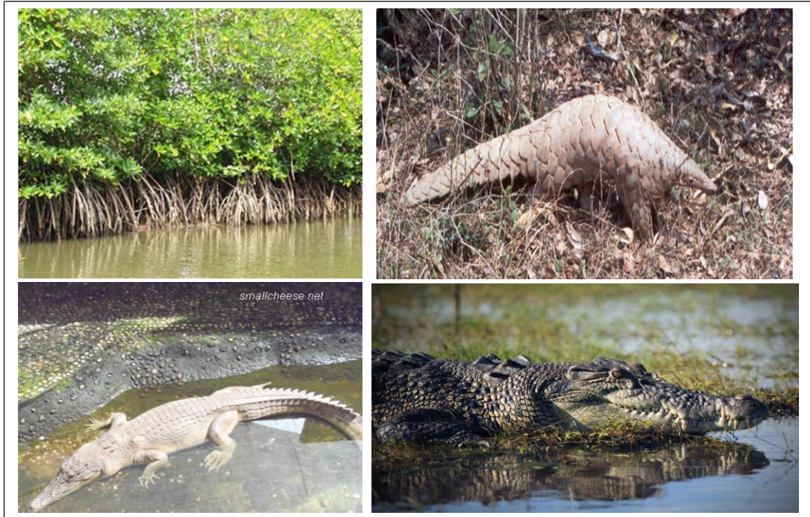
Fig 10:- The marine mega-biodiversity in Bhitarkanika Estuary

Bhitarkanika is home to India's largest population of giant saltwater crocodile, the largest crocodile on earth. Also It is home to more than 215 species of avifauna including amazing eight variety of Kingfishers Fig 10 . It is the second largest viable Mangrove Eco-System along with a large number of estuarine crocodiles. There are 80 estuarine crocodiles found in 2017 whereas the reports 75 and 70 in the year 2016 and 2015. Three giant male crocodiles measuring more than 20 feet long were reported by enumerators. This included a 21-foot long reptile which finds a pride of place in the Guinness Book of World Records as the longest living crocodile. As many as 40 large-size crocodiles measuring 14 to 19 feet were sighted during the annual headcount operation conducted between January 3 and 10 in 2017 Fig 11(b) .