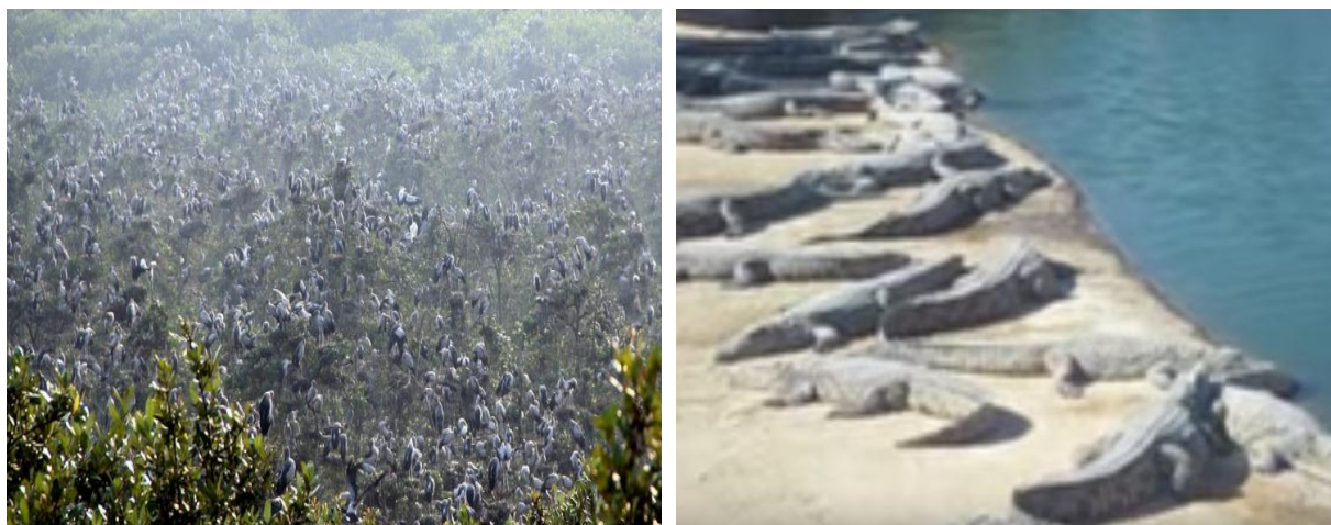
Fig 11 (a):- The paradise for guest birds in the sanctuary Fig 11(b) Sunbathing crocodiles at Bhitarkanika

Bhitarkanika is home to India's largest population of giant saltwater crocodile, the largest crocodile on earth. Also It is home to more than 215 species of avifauna including amazing eight variety of Kingfishers Fig 10 . It is the second largest viable Mangrove Eco-System along with a large number of estuarine crocodiles. There are 80 estuarine crocodiles found in 2017 whereas the reports 75 and 70 in the year 2016 and 2015. Three giant male crocodiles measuring more than 20 feet long were reported by enumerators. This included a 21-foot long reptile which finds a pride of place in the Guinness Book of World Records as the longest living crocodile. As many as 40 large-size crocodiles measuring 14 to 19 feet were sighted during the annual headcount operation conducted between January 3 and 10 in 2017 Fig 11(b) .