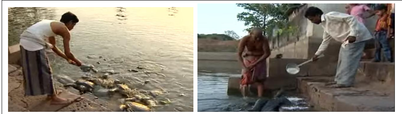
Fig 4:- Co-habitation of man and inland Tortoises at Maneswar Sambalpur Odisha

These monstrous eating habits of these species could maintain the harmful invasive species (HIS) and protect the environment and maintain the water quality. The Indian soft-shelled turtles are distributed in large river systems like Mahanadi, Ganges and Indus. These also occur in large ponds and water bodies in the mainland. Besides Maneswar, these turtles are also getting protection in places like Parvati Sagar Pond in Puri, Champeshwar at Cuttack and Golia in Ganjam district. Maneswar is also. The jungle cats, small-clawed otters, jackals and various water birds are found in village jungles of Maneswar.