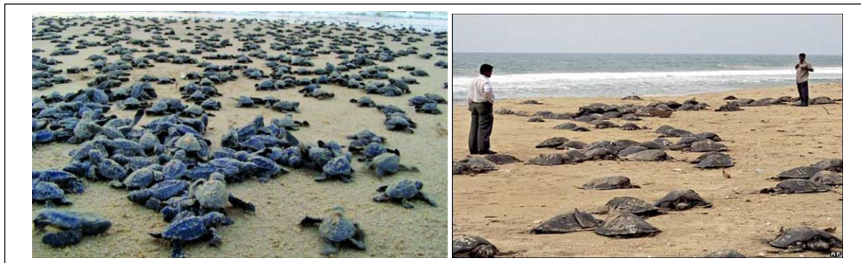
Fig. 5:- Hatchery for Marine Tortoises at Rushikulya R. and Bahuda R. Estuary Ganjam Odisha

Bhetnoi, Golia village in Buguda Block, Ganjam district in south Odisha, is famous for the conservation of freshwater tortoise in a pond measuring of about 3 acres area is known as Nila Pokhari (Blue colored pond). The villagers consider about 300 reptiles of the pond as sacred and established an intimate relation and preserve them as an act of people's participation and also along Rushikulya Estuary ( Fig 5 )