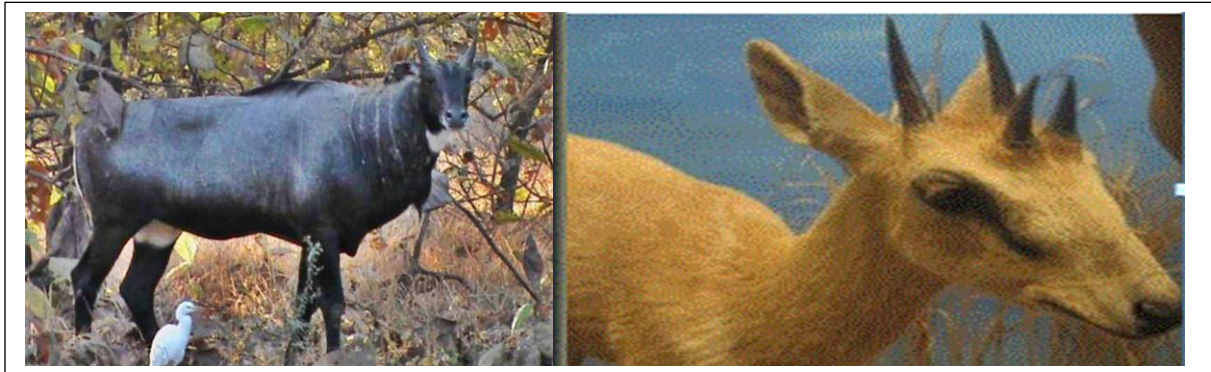
Fig.7:- The Species the native Bison and Chausingha in Ushakothi sanctuary

The Ushakothi WLS, in Sambalpur exist running parallel to NH.6 is 43Km long ( NE stretches for more than 130Km) . The Sanctuary harbors Elephants, Tigers, Gours, Sambars, Black Panthers, Spotted Deer, and Wild Bears etc. The population of these mammals/species needs to be recorded for future IUCN counts Fig-7.