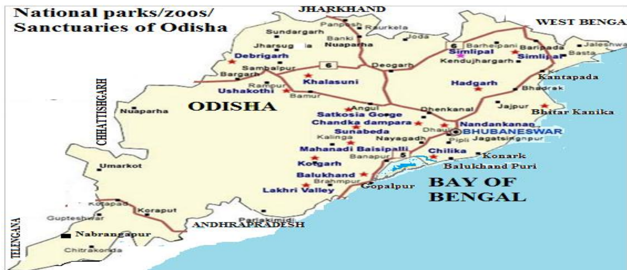
Fig 3:-The national parks, Zoos, WLS, Bird sanctuaries of Odisha

In addition there are two tiger reserves and three elephant reserves in the State. The other 11 mini Zoos have been identified for ex-situ conservation and running of wildlife national parks, reserves and sanctuaries of Odisha are shown in Fig 3 .