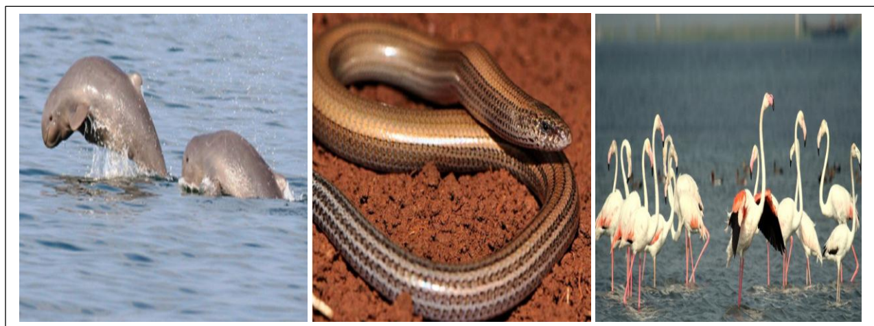
Fig 12:- The Irrawadi Dolphins, the Limbless skinks and rare bird species of in Chilika Lagoon, Odisha

Chilka, the largest brackish water lagoon in south Odisha, is a mega biodiversity hotspot and also was included in IUCN and Ramada sites. About 1010Km 2 pear-shaped lake was 3000 years old and was a gulf during the post-Holocene period. The barrier spit separates the ecosystem to a fragile marine-semi marine-freshwater biome. The lake habitats are about vertebrates (400 numbers), crocodiles (4 types), mammals (24 types), and reptiles/amphibians (37 types). It is also rich in floral diversity (726 types) five types of grasses and mangroves (Fig 9). There are 150 species of marine strata, 119 numbers brackish water species and 24numbers of freshwater species.