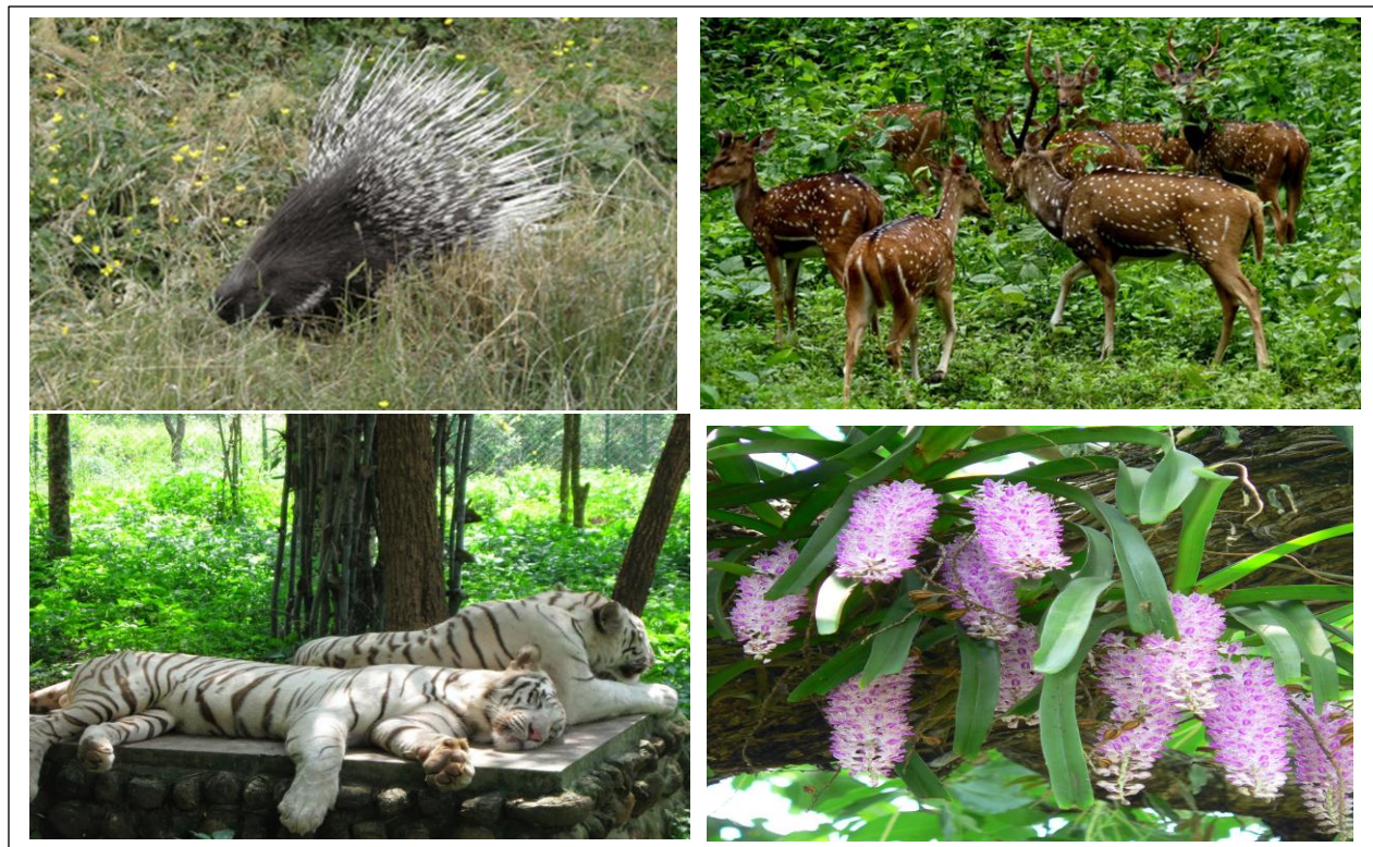
Fig 9:- Mega Diversity of Flora and Fauna at Simlipal reserve forest Mayurbhanj Odisha

Simlipal is home to 99 royal Bengal tigers and 432 wild elephants. Besides Simlipal is famous for gaurs (Indian bison), chausingha (four horned antelope), as well as an orchidarium. This reserve is part of the UNESCO World Network of Biosphere Reserves since 2009.