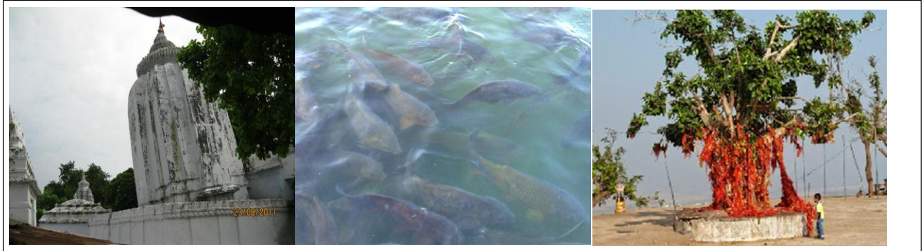
Fig 6:- The worshipping of aqua fauna near tilting temple at Huma, and preserving biome, worshipping trees