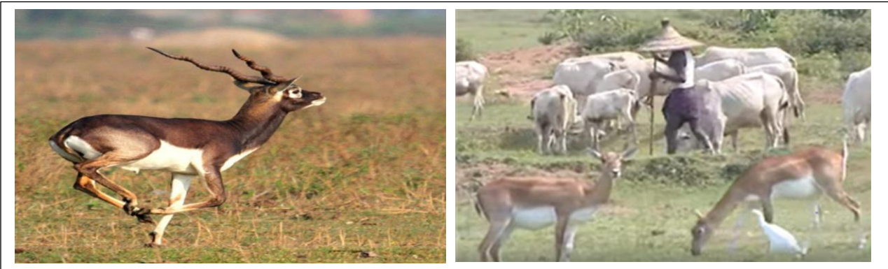
Fig 8:- Black Buck, Bhetnai, Asika, Ganjam – Where they roam freely with villagers.

Balipadar-Bhetnoi: The Indian Blackbuck ( Antelope cervicapra ), is one of the endangered species (IUCN red list) found in Odisha ( Fig 8 ). These endemic animals were plenty (1200 to 1300 in the 1960's) in India but their number was reduced to about 500 to 600 in 1990's. They were listed in Schedule-I of Wildlife (Protection) Act, 1972 and is designated as Vulnerable as per Red Data Book (1994). These rare species were traced at present in Balasore, Puri, Kendrapara Bolangir and Kalahandi and Ganjam Districts. The people of Balipadar-Bhetnoi (58.402 km 2 ), areas in Ganjam District are kind to preserve them. In Konark-Balukhand WLS area they are also increasing.