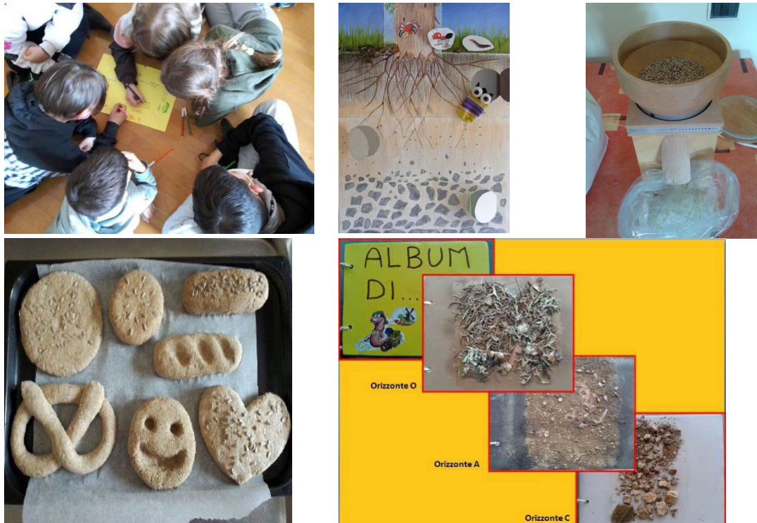
Figure 13. Images from the Italian winner, The soil to educate.

Primary school runner up: The soil to educate – Italy