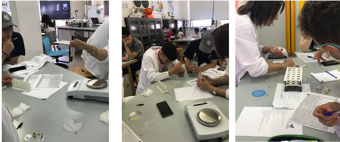
Figure 5. Images from pupils working in the project Carbon cycle soil and biodiversity.

The first runner up: Carbon cycle soil and biodiversity – Italy