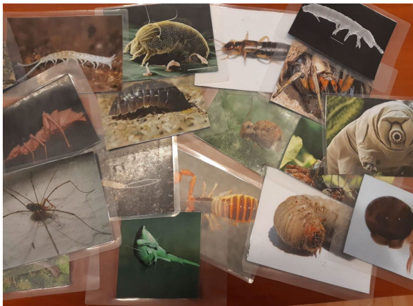
Figure 9. Soil zoology: Unrealistic soil living macro organisms.

Soil zoology: Unrealistic soil living macro organisms - Hungary