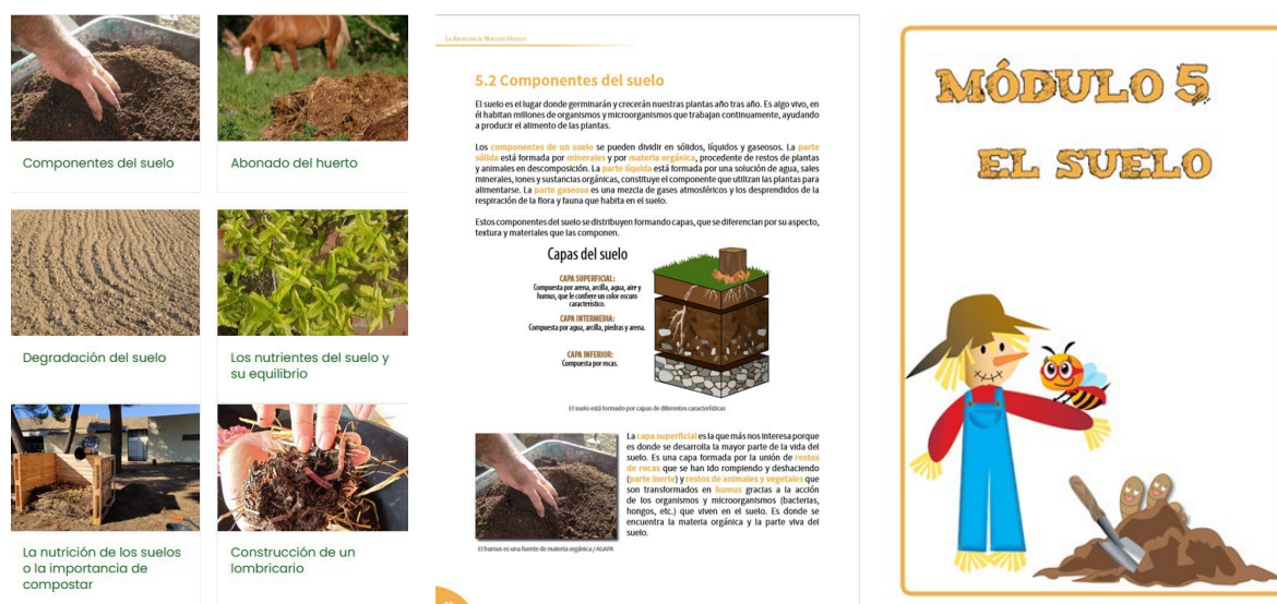
Figure 17. The Andalhuerto Ecological Project from Spain.

This project directly involved schools and pupils in the age of three to sixteen years old in the region of Andalusia, in the field of organic orchards to promote biodiversity, self-sufficiency and soil care. The project offered advice to schools on the installation of orchards at schools yards, and provided advice on any aspect of management related to the orchard (soil, biodiversity, plant health etc.). It also offered online courses for teachers on organic agriculture, soil conservation and orchards as didactic tool. Some events was organized as workshops on ecological gardens, on-site workshops and visits to demonstrations orchards to demonstrate soil care and sustainability in a practical manner, as well as to show organic food and how it can contribute to healthy eating. For further information, please visit Best Teaching Practices | Prepsoil