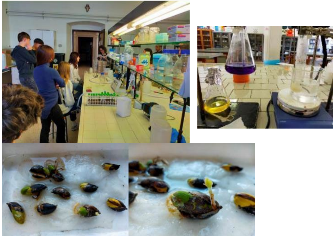
Figure 21. Images from the project Soil is life from Italy.

In this project, fifteen to eighteen years old were engaged in experimental scientific activities, such as setting up macro and microscopic examination of culture of microorganisms (bacteria/fungi). Further, they studied seed germination in relation to different growth substrates. An activity for older students was in the process of being implemented. In that they will design a light-tracking agro-photovoltaic panel which can move according to a weather control unit, so in case of bad weather, the panel could flip over and expose its shock-protection side. The objective of the project was to increase soil literacy, how to protect it and create awareness about it. The project targeted an international level but emphasised the national level. The focus was on the complexity of relationships and interdependence in ecosystems throughout the project. For further information, please visit Best Teaching Practices | Prepsoil