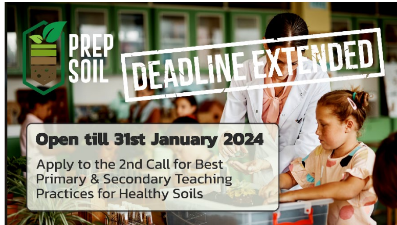
Figure 2. The call advertisement from 2024.