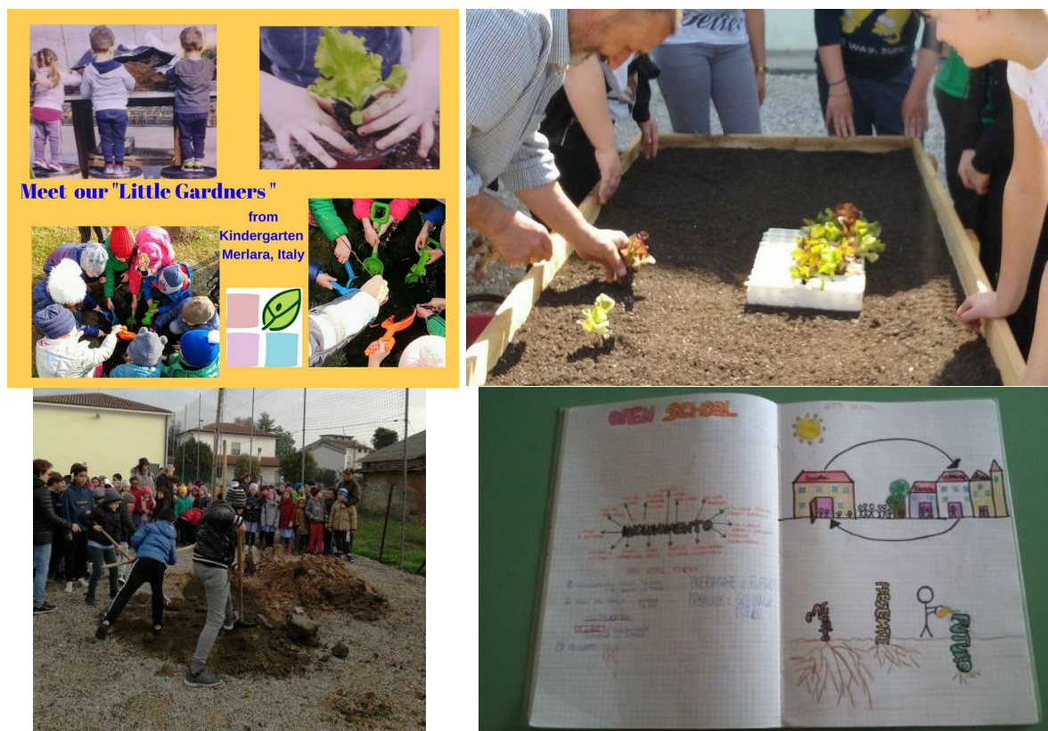
Figure 8. Working together in the Open School for Open Society from Italy.

Open School for Open Societies (OSOS) – Italy