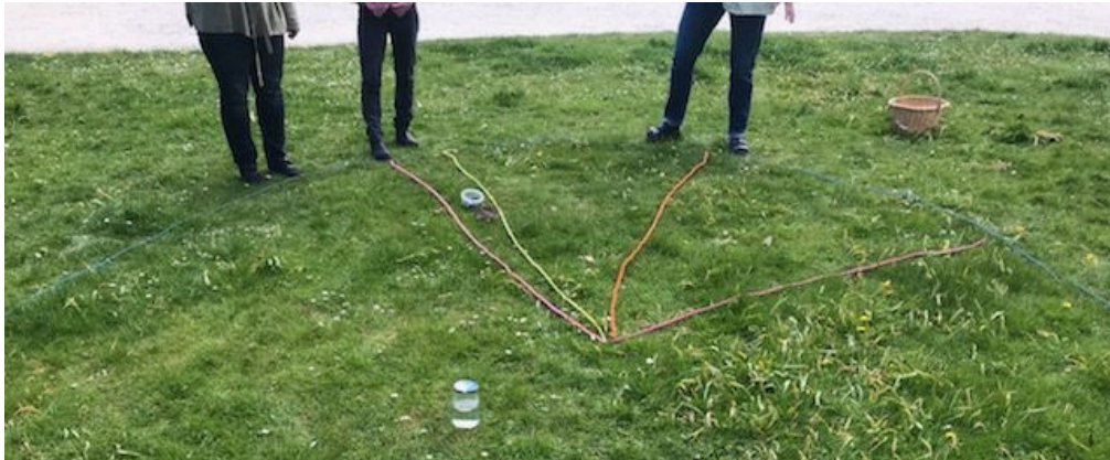
Figure 6. The earth's surface as a circle. How can the area be divided? What proportion is arable land? The vital soil from Sweden.

The second runner up: The vital soil – Sweden