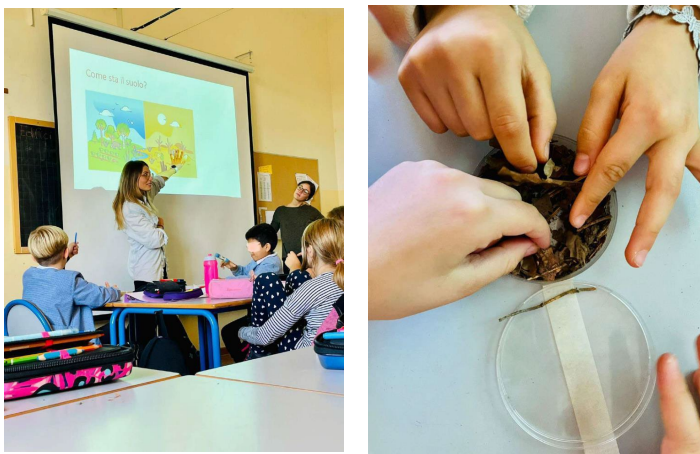
Figure 20. Our friendly soil: Do you know that everything you eat comes from the soil?

Our friendly soil: Do you know that everything you eat comes from the soil? – Italy