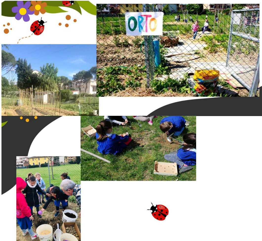
Figure 7. The vegetable garden in the project Earth, Earth, Earth from Italy

A vegetable garden was central for the activities carried out in this project. Children between six and thirteen years old were invited to interact with soil using different senses in activities like sowing, observing growth as well as making and using compost. The garden was also used for being creative through soil by using it for painting (inspired by Richard Long) and listening to Chiara Carminati's poetry and soundtrack. The purpose of the activities were many, but some related to culture through exploring generational expressions and to safeguard traditions as well as personal growth through engaging in group work and taking care of younger. Additionally, by discussing food safety and understanding the origin of certain medicines and the use of herbalism, health was an important theme. For further information, please visit Best Teaching Practices | Prepsoil