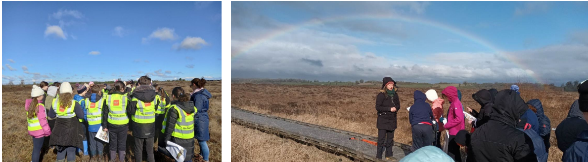
Figure 12. Images from the Irish project, Love your wellies.

Primary school winner: Love Your Wellies – Ireland