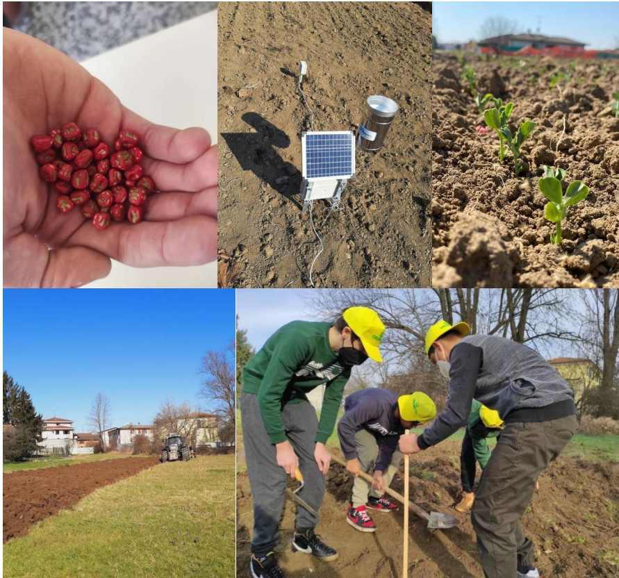
Figure 19. Images from the project Young Farmers Grow: a field trial project of regenerative agriculture in Italy.

Young Farmers Grow: a field trial project of regenerative agriculture – Italy