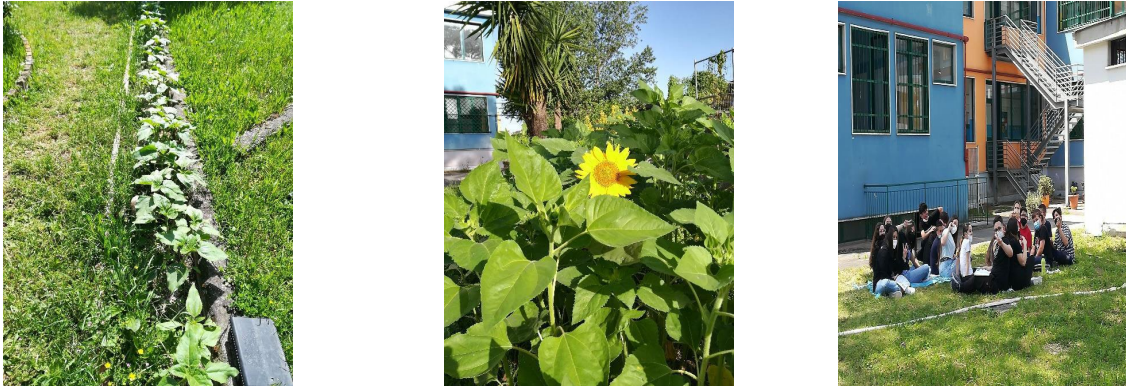
Figure 14. The winner: Economy is the wheel from Italy.

Secondary school / vocational training winner: Economy is a wheel – Italy