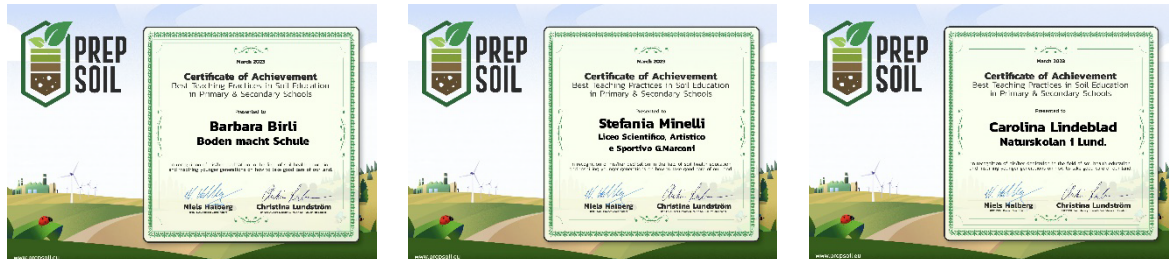
Figure 3. Diplomas to the winner and the two runners up from the call 2023