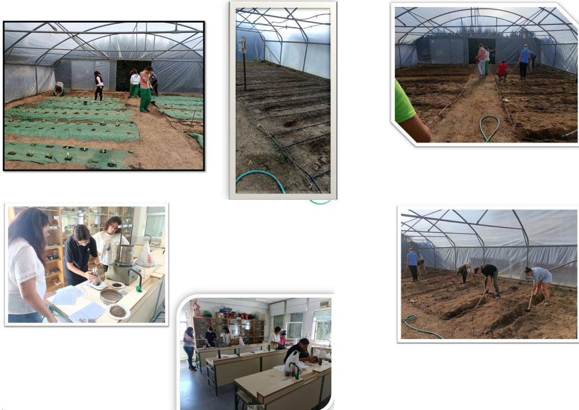
Figure 18. Images from the project Castillo de Luna Vocational Training School.

Castillo de Luna Vocational Training School – Spain