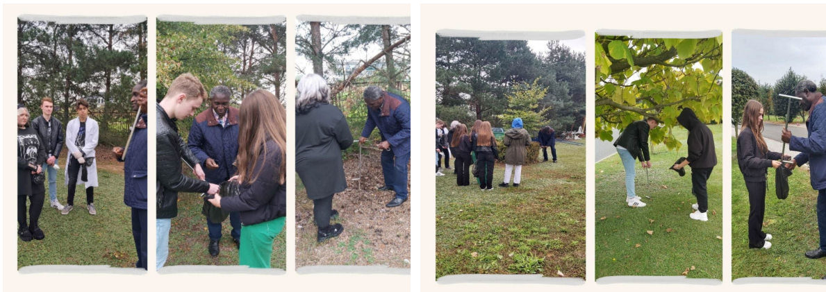
Figure 16. The School Soil Laboratory, Glebowe from Poland.

The School Soil Laboratory, Glebowe – Poland