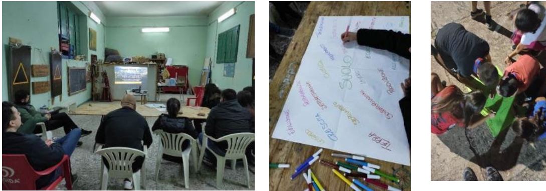
Figure 22. Images from the project I care soil from Italy.

This project focused on the lack of awareness about the importance which contributes to soil degradation. It generated a constructive dialogue and provided practical exercises from which the students in the age of eight to sixteen years old could see the importance of soil. The activity aimed to teach students to recognize animals living in soil – from bees to microorganisms. The students also participated in taking soil samples and analysing the samples. A professor demonstrated through an experiment how a solution with soil and reagents changed colour with variations from purple to red to green due to the interaction between some components of the soil and reagents. For further information, please visit Best Teaching Practices | Prepsoil