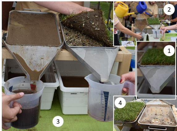
Figure 10. Images from pupils working with soil degradation in a Hungarian project.

Soil degradation: erosion by water - Hungary