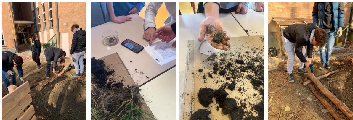
Figure 15. The runner up: World Soil Day from Italy.

Secondary school/vocational training runner up: World Soil Day – Italy