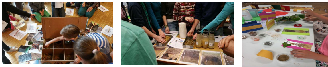
Figure 4. Images from the winning Austrian example in 2023.

Through several activities arranged by The Austrian Soil Science Society, pupils were introduced to soil. A series of workshops let children between nine and thirteen explore soil through four stations where they identified animals living in soil, conduct scientific experiments and put their hands into soils. The experiments included a filter experiment, observations through microscope and definition of soil texture by touching the soil. By touching, watching, smelling and even listening, pupils used almost all their senses to observe soil. At least fifteen workshops were held per year in Vienna. For further information, please visit Best Teaching Practices | Prepsoil