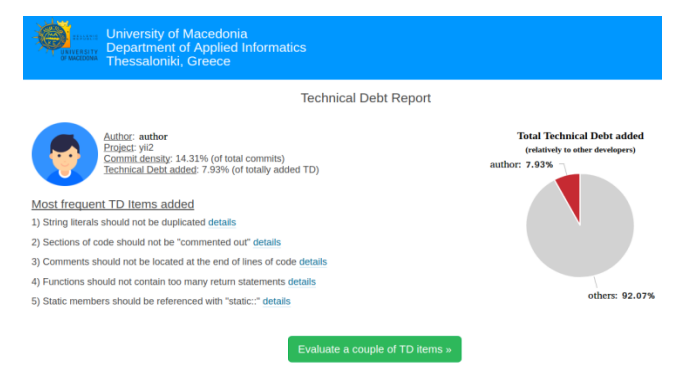
Figure 1: Anonymized TD report of a developer in Yii2.

Prior to the request for participating in the evaluation of TD items (even just a single one), developers have been provided with a personalized report of their current activity including their commit density, contribution to the overall TD of the project (relatively to the rest of the developers) and the top-five code violations they insert into the code. The report for a random developer (with anonymized information) for project Yii2 is shown in Figure 1. The obtained response rate in our study was 35%.