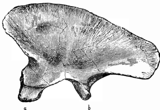
Left ilium of Creosaurus atroæ Marsh. Outside view.