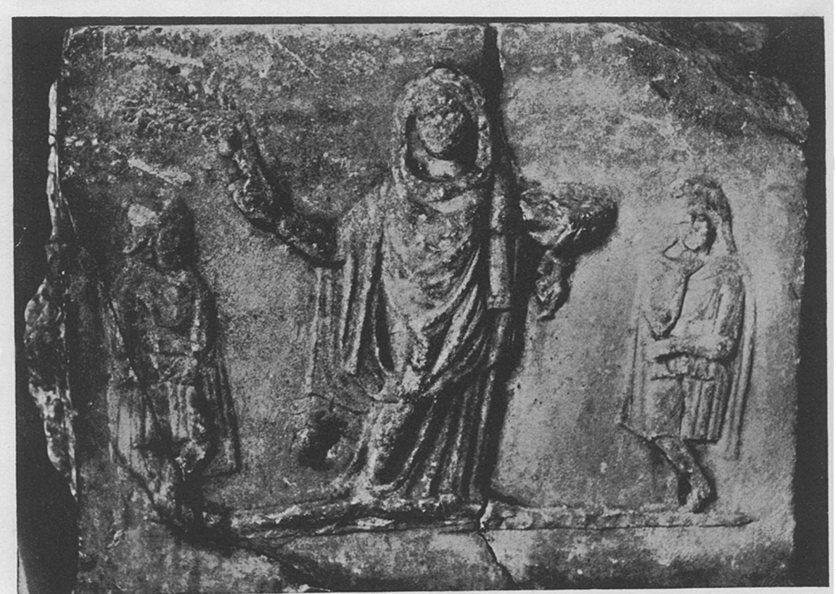
CYBELE ALTAR IN LONDON.