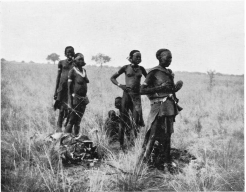
BEIR WOMEN , with bundle of white-eared cob skins on ground