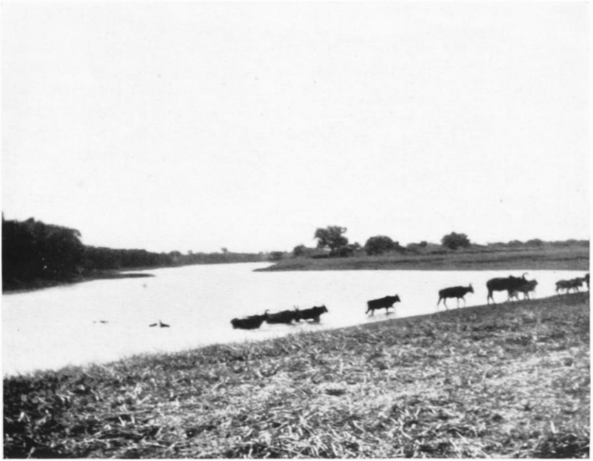
CATTLE SWIMMING PIBOR RIVER NEAR WEIKODNI Voey trees on high bank left; single Kuk tree in centre