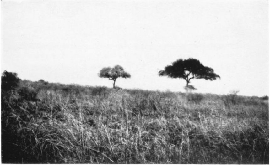
Heglik trees and Kitta thorns : waterbuck in long grass