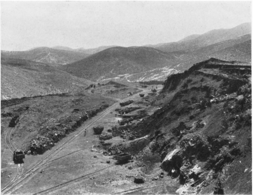
IRON-ORE MINE AT MOUNT UISHAN, SOUTH OF MELILLA