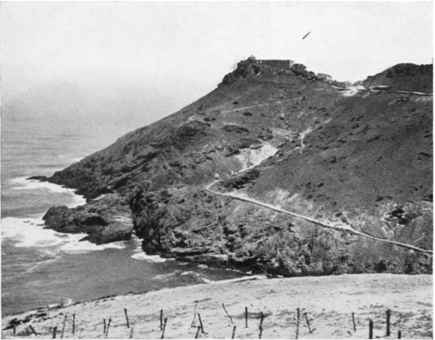
CAPE TRES FORCAS