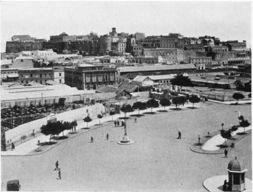
MELILLA IN 1916