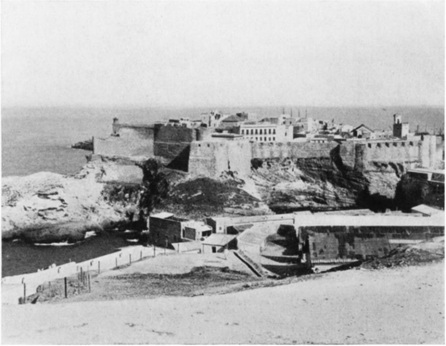
MELILLA IN 1909