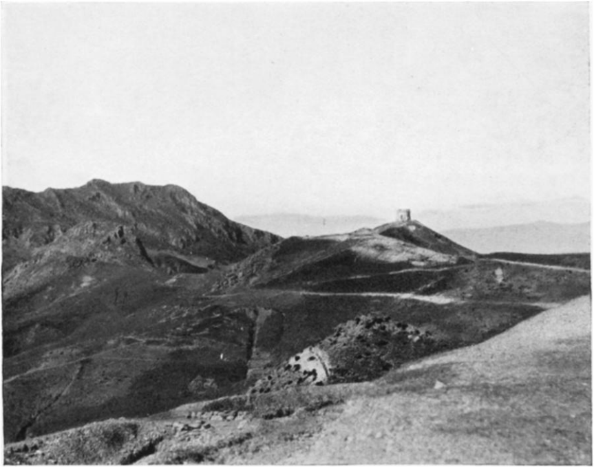
MOUNT SIDI MUSA