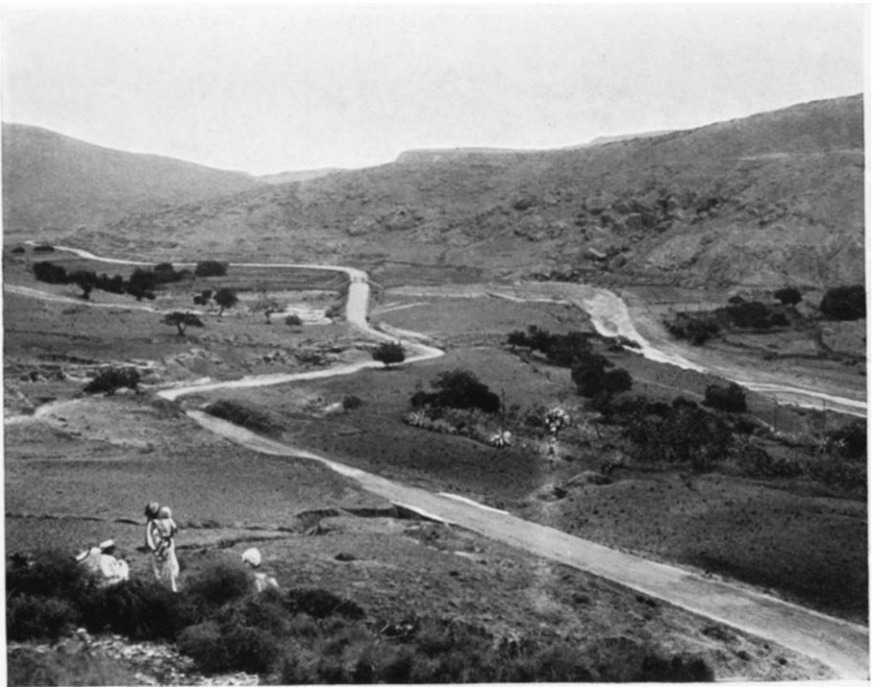
THE ROAD FROM MELILLA TO SAMMAR