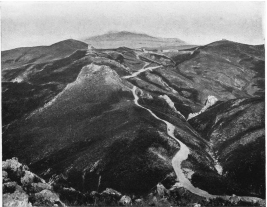
VIEW OVER CEUTA FROM JEBEL INIDER