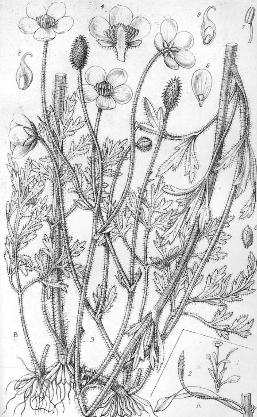
A. 1, 2 RANUNCULUS SCELERATUS, L. var. MYOSUROIDES, Wats. B. 3, 9 " " PANGIENSIS, Wats.