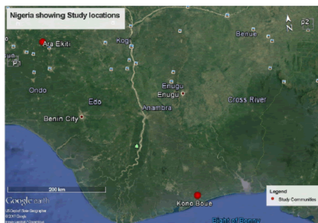
Fig.1: Map of the study area showing the locations of clay deposits