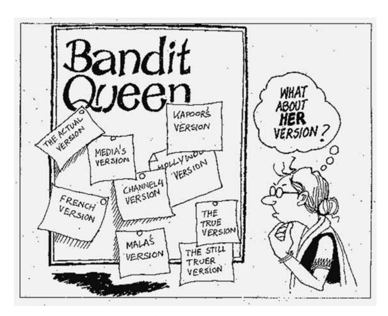
6.2 Cartoon depicting numerous versions of Phoolan Devi's story.

Phoolan Devi's case is extremely interesting and at the same time problematic for highlighting Spivak's methodological interventions on questions of representation,