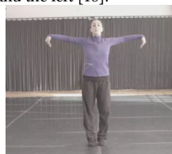
Figure 5 Symmetrical pose

Symmetry is defined as the use of the two sides of the body (right vs. left side, arm, leg) etc., both in position and while moving (Fig.5 and Fig.6). It is the ability to do the same thing simultaneously or sequentially using both sides. For example, in natural continuous walking, there is not one moment that the body is in a completely symmetrical pose, but each step is sequentially symmetrical to the other. This is actually an example of mirroring one pose or a motion. Each Movement Principle includes also the opposite. Playing with asymmetry and isometry is included in this principle. An extension of the Symmetry principle including Dynamic Symmetry, as well as other movement principles, is included in the EyesWeb software library for the automatic analysis of movement qualities[25][4] that has been experimented in WhoLoDance also in a dance performance by Stocos (Muriel Romero and Pablo Palacio). The use of the two sides of the body in different combinations had been the basis of different movement analysis and notation systems. The body has an ideational division, by way of the spine, into two halves, the right and the left [18].