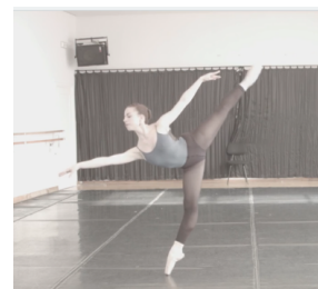
Figure 8. Arabesque off balance