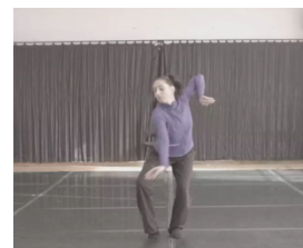
Figure 6 Asymmetrical pose

To define symmetry, we need to define an axis reference. The human body is (almost symmetrical) to the vertical axis and the most common way to define a pose as symmetrical is if the limbs are symmetrical (Left and Right Arm in the same direction, level, bend or extended equally, rotated equally). The following list includes the concepts which have been used to prepare and organize the movement sequences which were related with the Symmetry Movement Principle: On Spot vs. Travelling, Symmetry in time vs. Shape symmetry (in a pose), Asymmetry, Isometry, Sagittal and Horizontal Symmetry, Symmetry and travelling.