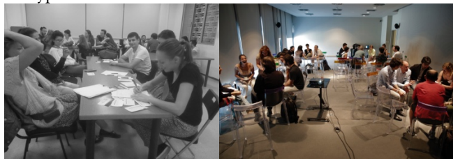
Figure 3. Participatory workshop in Athens

All of the interviewees recognized the movement principles and were able to identify some that resonated more with their practice than others. For example, directionality, co-ordination, motion through space and alignment were important for teaching for some participants. When performing, two participants shared that they would think about the same principles as when they teach, indicating that these principles are foundational knowledge and personal to their practice. Each interviewee appeared comfortable with the principles as presented, suggesting that the movement principles identified and categorized within the project were appropriate and meaningful for the dance practitioners. We were thus able to conclude that the movement principles are widely recognized as a useful foundation to most dance practices. During two participatory workshops (Fig.3 and Fig.4), participants have worked in groups to provide examples of matching dance genre, movement principles with particular tools of the projects, prototype visualizations and interactions.