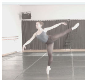
Figure 7. Arabesque in balance

Contrary to Directionality which refers to the body relationship of the body with the outer space, Alignment refers to the virtual lines of the various body parts and points while standing or moving. The following list includes the concepts which have been used to prepare and organize the movement sequences: Alignment between different body parts, horizontal, vertical and sagittal, alignment, using the 3 planes of the body, alignment in free movement, alignment while moving on spot, creating and virtual lines between two different body parts e.g. chin and shoulders, elbow and hand, alignment and balance, virtual sliding lines, virtual stretching lines, virtual matching lines and virtual rotating lines. Virtual lines in particular are a clear example, of how a generic principle lead to particular visual imagery which eventually can be translated into a virtual digital experience.