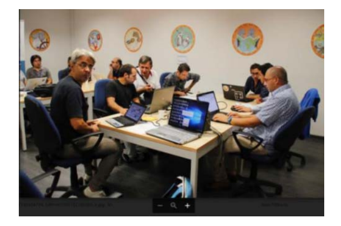
Figure 5. Solar Hackaton

Within SoLL community, attention is paid to make technologies fully accessible by a wide unskilled audience.