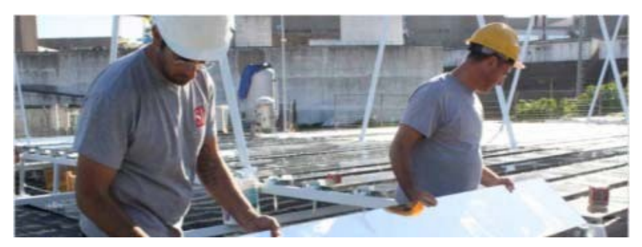
Figure 8. Local company staff at work in the demo plant

Engineering companies are experiencing the design process at a pilot scale, preparing themselves to exploit their potential at a broader and larger scale.