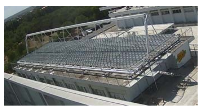
Figure 4. SoLL twinned research infrastructure in Cyprus