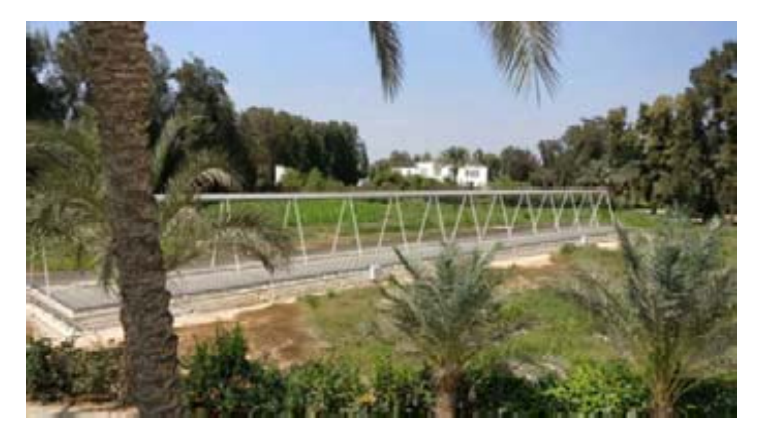
Figure 3. SoLL twinned research infrastructure in Egypt