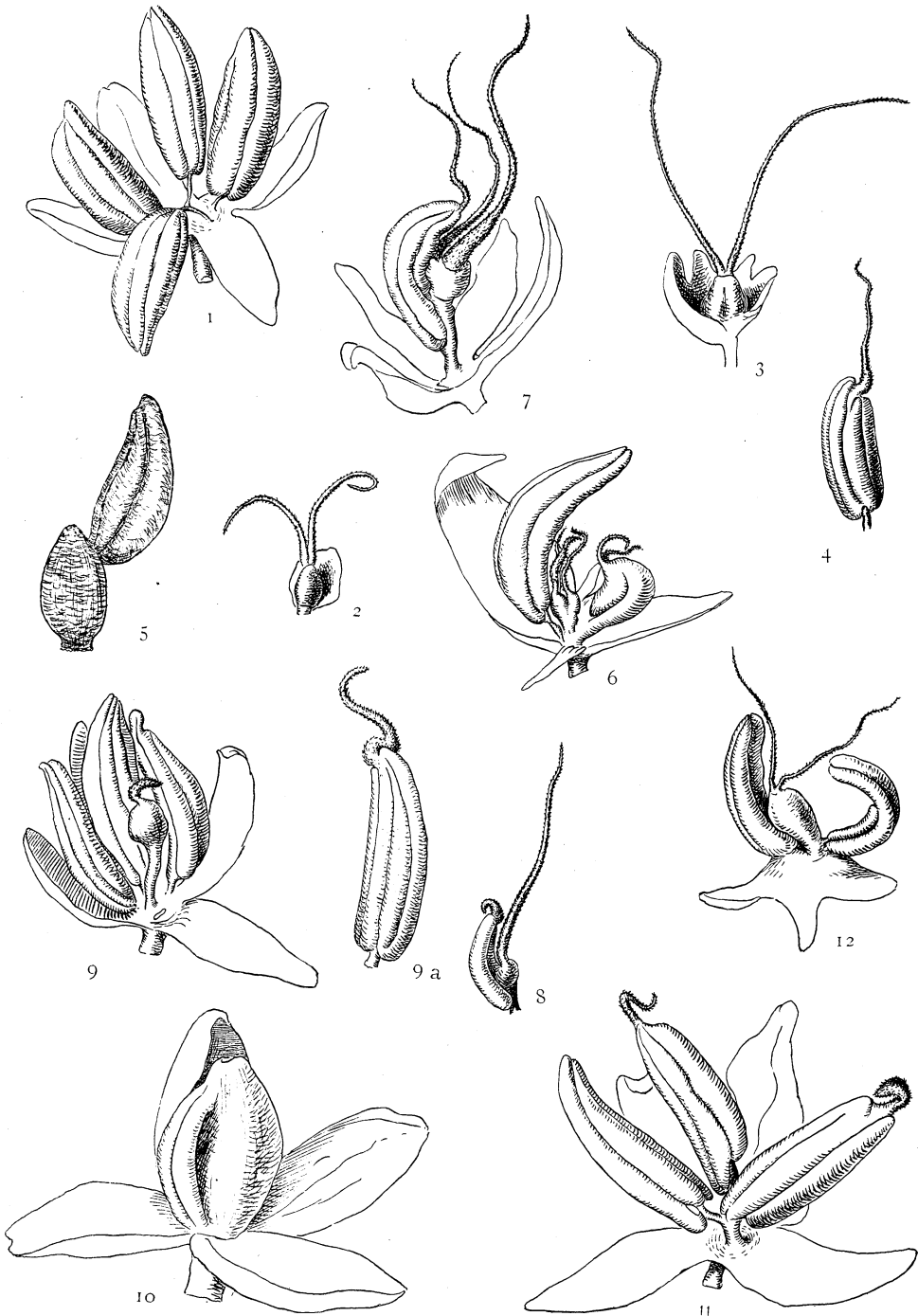
SCHAFFNER on HEMP