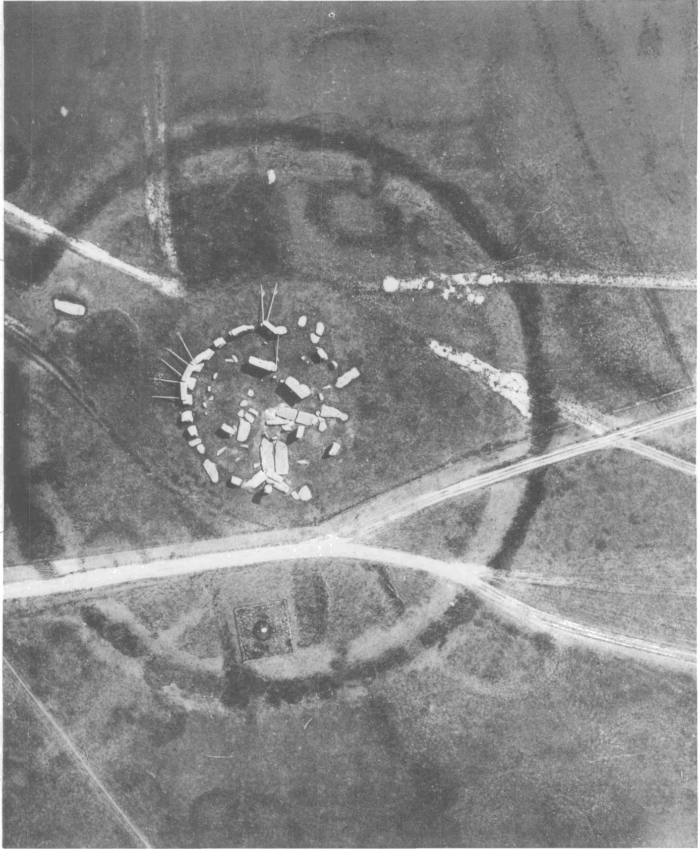
STONEHENGE AS SEEN FROM A WAR BALLOON.

Published by the Society of Antiquaries of London, 1907.