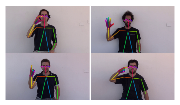
Figure 3: Extracted hand and body joints from video sequences of the LSA64 dataset.