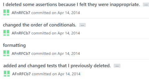
Figure 1: A section of garbled commit history

reviewability. In the third phase, to triangulate our findings, we deploy a tool that allows reviewers to rate the reviewability of a change they have just reviewed. We collect real world data from 35 developers, and we observe that factors identified in the second phase of our study are confirmed. This allows us to put forth an empirically verified definition for code change reviewability.