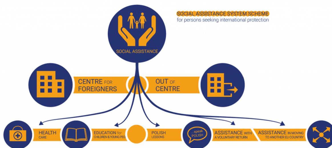
Figure 2: Social assistance for applicants for international protection in Poland