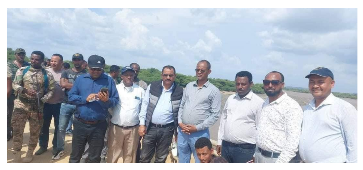
Fig. 3. Officials of Gondar, Bahir Dar (BDU), Debre Markos, Debre Birhan, Debre Tabor, Wollo, Woldiya and Debarq Universities on the Tekeze bridge in Humera<sup>112</sup>. They were on an organised visit to the armed forces in the occupied Western Tigray. The same officials have never visited their own university colleagues who are in concentration camps in Amhara Region. There is also no evidence that in Humera, they inquired about the dire human rights infringements in that town.