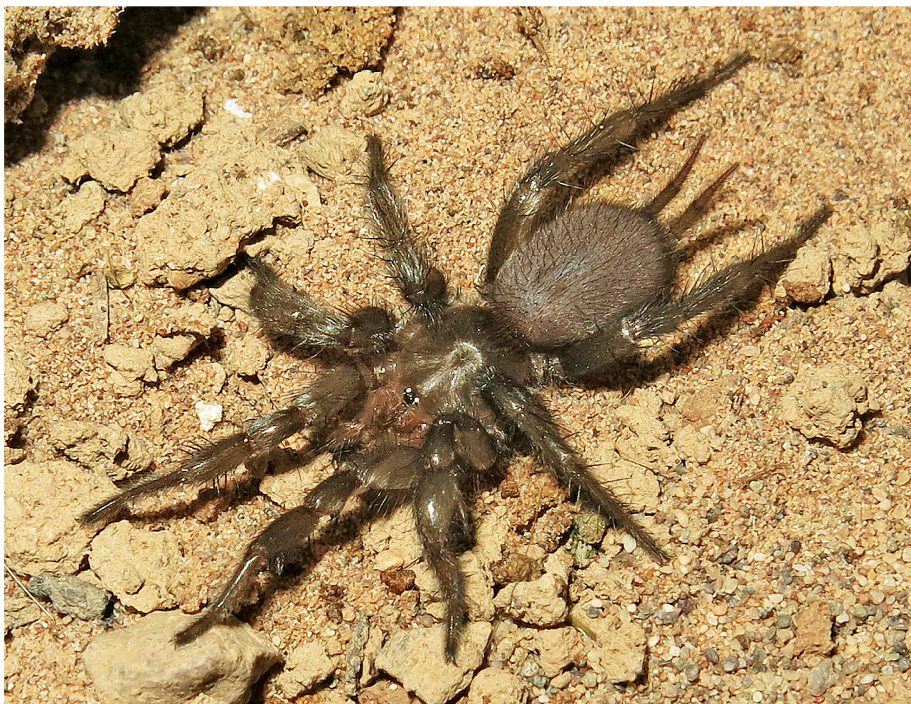
Fig. 1. Phyxioschema gedrosia sp. nov., habitus of live male holotype (photo by A. Zamani).

Description: Male: Colour in alcohol: Carapace (Figs 1, 2A) uniformly light brown; eye mound black. Palpal coxae light brown, prolateral zone only indistinctly lighter than rest of ventral side (Fig. 2B). Labium with cream-coloured anterior half and light reddish brown posterior half (Fig. 2B). Sternum mostly light brown; margin, fused anterior pair of sigilla (forming postlabial depression) and separated three pairs of sigilla light reddish brown (Fig. 2B). Legs (including ventral side of coxae) mostly light brown, their ventral side slightly lighter than dorsal side; entire dorsal side of tibia I, patches at bases of spines on ventral side of tibia I (Fig. 2F), entire metatarsus I and most of tarsus I (except for pseudosegmentation) distinctly darker; small retrodorsal-distal patch, large prodorsal-prolateral-distal patch (extending back to band of hooked spinules) and entire ventral spur of tibia II, and proximal third