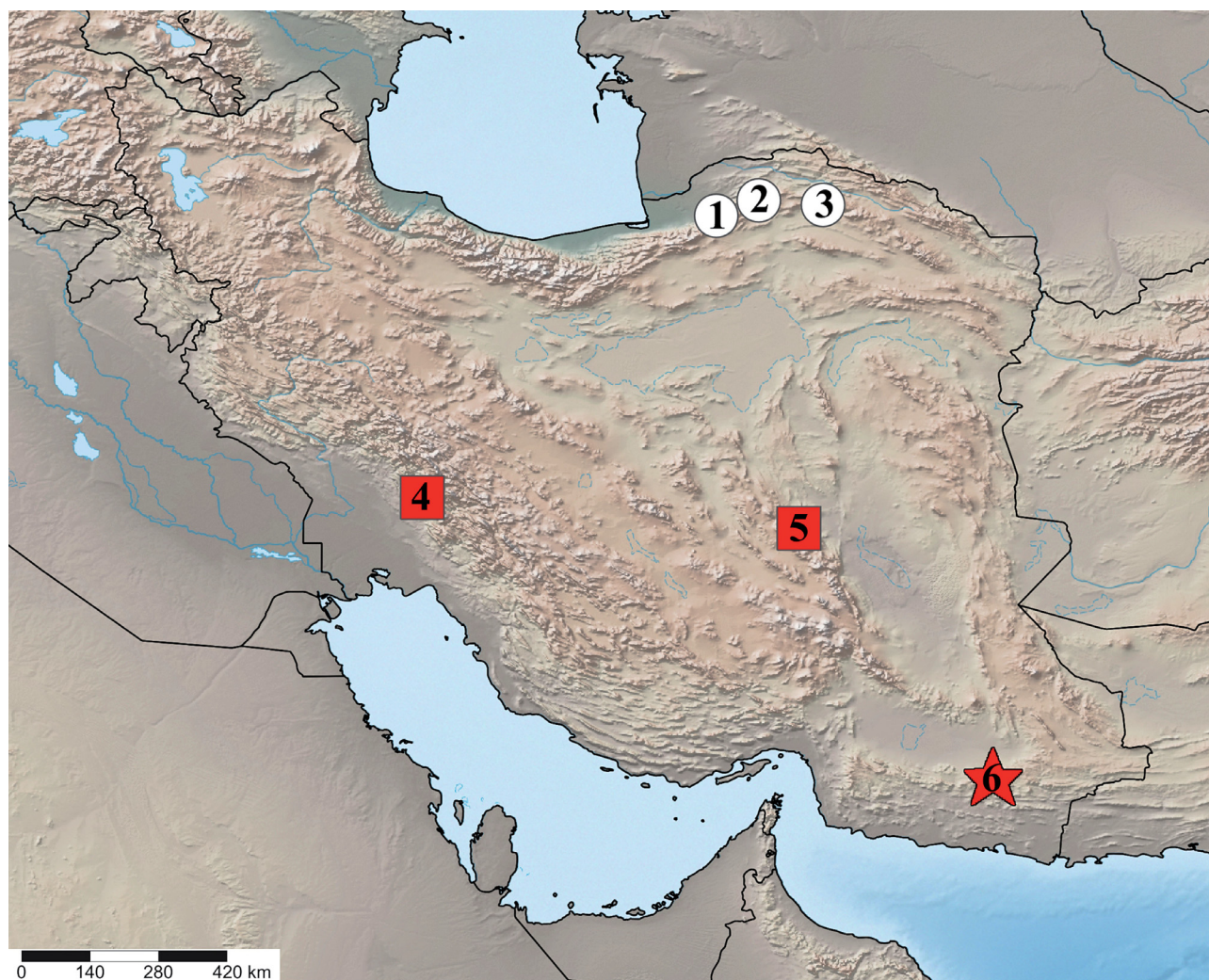
Fig. 4. Localities of Phyxioschema spp. in Iran. Circle: P. raddei ; star: P. gedrosia sp. nov.; square: Phyxioschema sp. White symbols refer to literature records, red symbols refer to our new data. 1 = Golestan Prov., Shahpasand; 2 = North Khorasan Prov., near Dasht (Schwendinger & Zonstein, 2011); 3 = North Khorasan Prov., Assadi, 30 km S of Bojnoord, 37°14'N, 57°15'E (Zamani et al. , 2017); 4 = Khuzestan Prov., Izeh, Takht-e Kashan; 5 = Kerman Prov., 20 km north of Ravar; 6 = Sistan & Baluchistan Prov., Bashagard Mts, Haboudan Village.

area, with the main vegetation consisting of the palm Nannorrhops ritchiana .