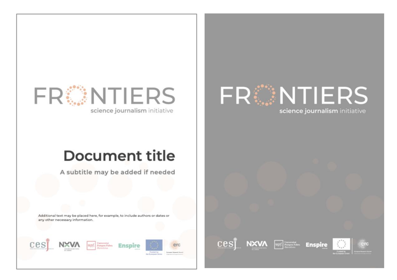
Figure 3 -Cover pages of the project's templates for reports.

The templates are shared among all project partners via the Drive. Besides being a space for sharing and storing documents and feedback, the project's Drive is the preferred tool for general project management, while email is the main tool for messaging among the partners.