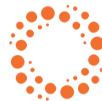
Figure 2 - FRONTIERS symbol (Positive)