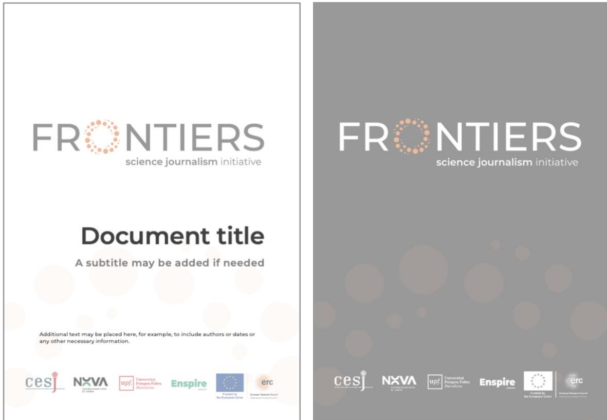
Figure 3 -Cover pages of the project's templates for reports.

The templates are shared among all project partners via the Drive. Besides being a space for sharing and storing documents and feedback, the project's Drive is the preferred tool for general project management, while email is the main tool for messaging among the partners.