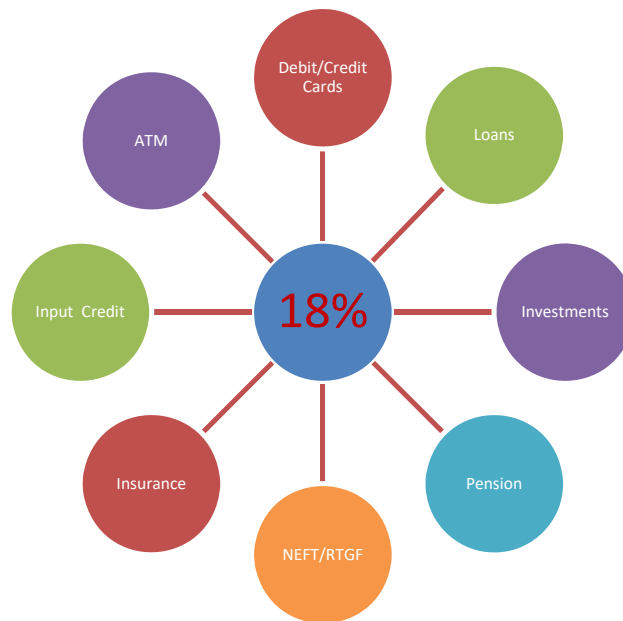
Fig. 2: The figure represents various products and services provided by banks which charge 18% GST replacing the 15% tax.

Investments like mutual funds are affected negatively due to the introduction of GST. GST bang on the income of mutual funds will certainly have an effect on the consumers. For an investment company, an expense ratio is a cost incurred by them to operate their mutual funds. The Goods and Service tax will be on the Total Expense Ratio of the mutual funds and has been increased by 3%. In case of the policyholders, they have to pay high premiums amount on their insurance assuming, a family spend a sum of Rs 50,000 per annum on insurance exclusive of service tax, their expenses will be increased by 3%, i.e., Rs 1500. Earning up to Rs 20 lakh will stay exempted from GST for mutual fund distributors [18], [19].