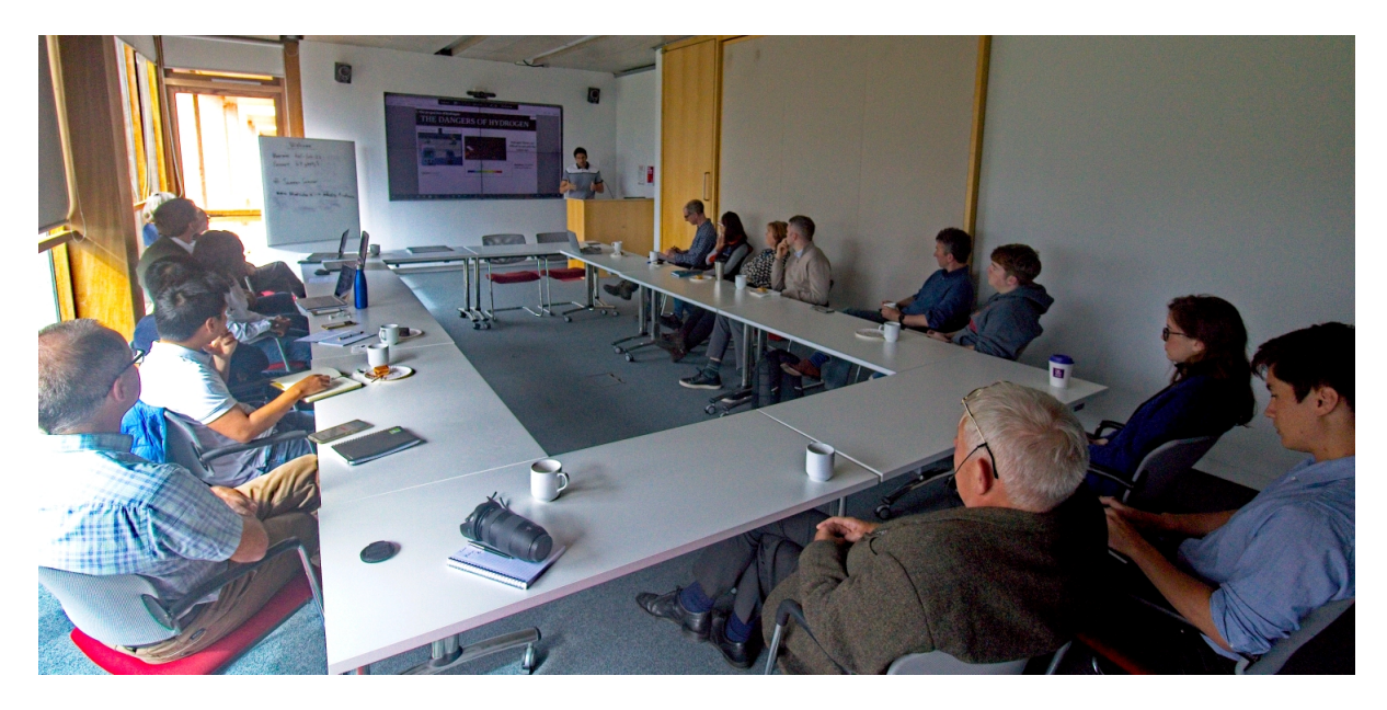
Figure 1: Summer Seminar Participants